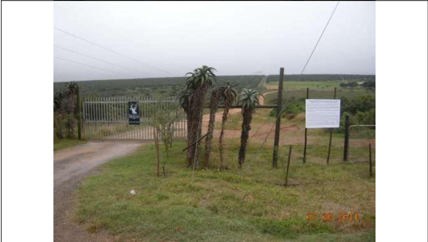
Site Notice Board