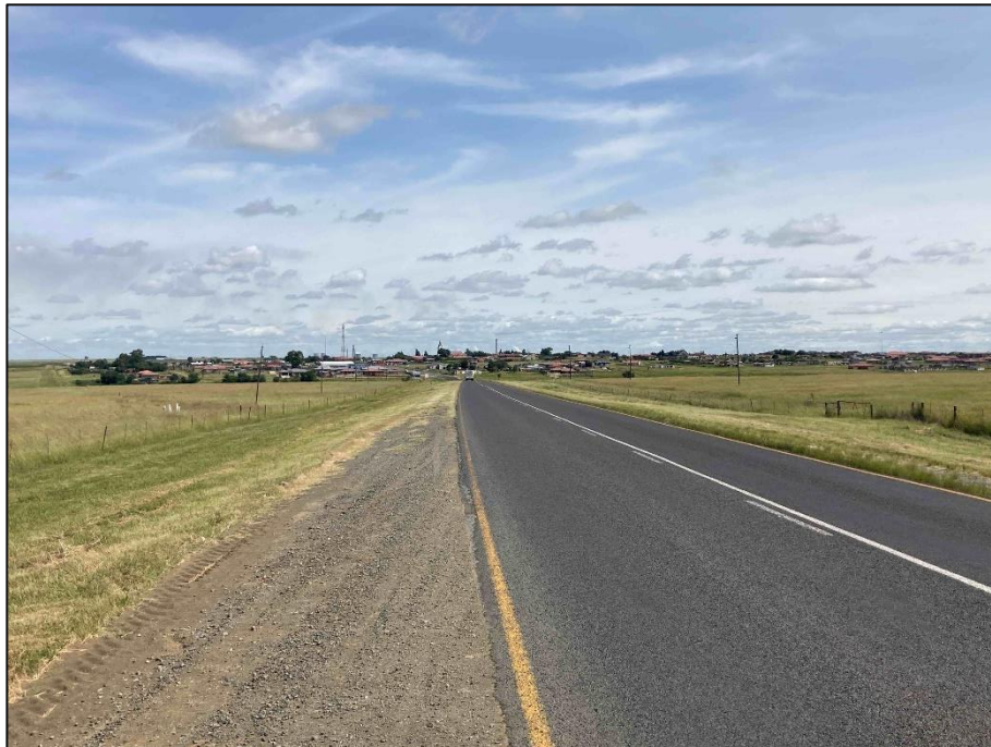
Figure 13: Approach (from the south on the R546) to the town of Charl Cilliers.

To the south-west of the Vhuvhili combined grid assessment corridor is the small town of Charl Cilliers ( Figure 13 ) forming a significant area of transformation in the landscape.