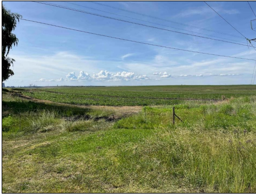
Figure 6: Maize cultivation in the study area

Final Basic Assessment Report: Proposed Development of a 132 kV Overhead Power Line and Supporting Infrastructure for the Proposed Vhuvhili Solar Photovoltaic Energy Facility, near Secunda in the Mpumalanga Province