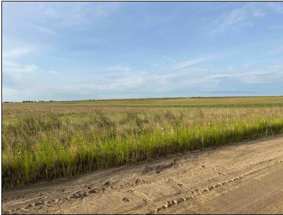
Figure 1: Flat to slightly undulating plains in the north-eastern portion of the study area

Final Basic Assessment Report: Proposed Development of a 132 kV Overhead Power Line and Supporting Infrastructure for the Proposed Vhuvhili Solar Photovoltaic Energy Facility, near Secunda in the Mpumalanga Province