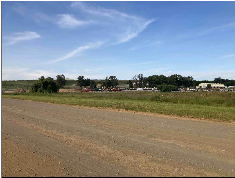
Figure 8: Mining /Quarrying Activity on the periphery of Secunda

Final Basic Assessment Report: Proposed Development of a 132 kV Overhead Power Line and Supporting Infrastructure for the Proposed Vhuvhili Solar Photovoltaic Energy Facility, near Secunda in the Mpumalanga Province