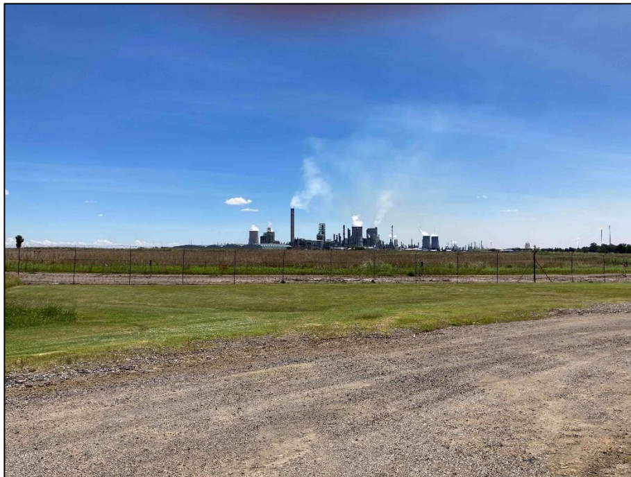
Figure 9: Sasol synthetic fuel plant located on the western boundary of the study area.