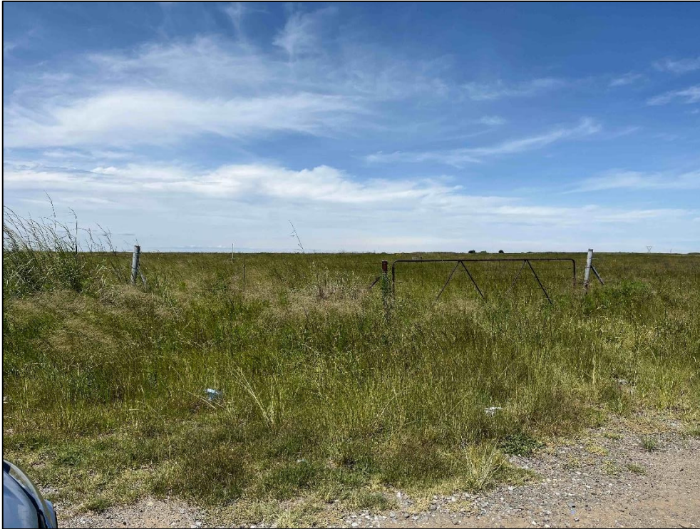
Figure 4: Grassland visible in the central sector of the study area.

According to Mucina and Rutherford (2006), the study area is dominated by the Soweto Highveld Grassland vegetation type ( Map 6 in Appendix F ) which is characterised by short to medium-high dense, tufted grassland ( Figure 4 ).