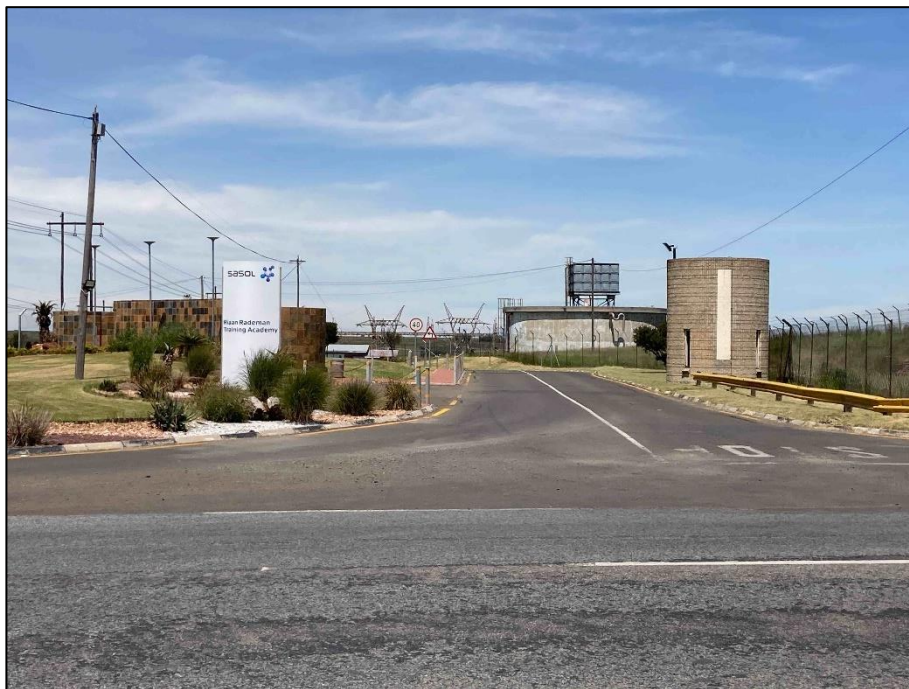
Figure 11: Riaan Rademan Training Academy