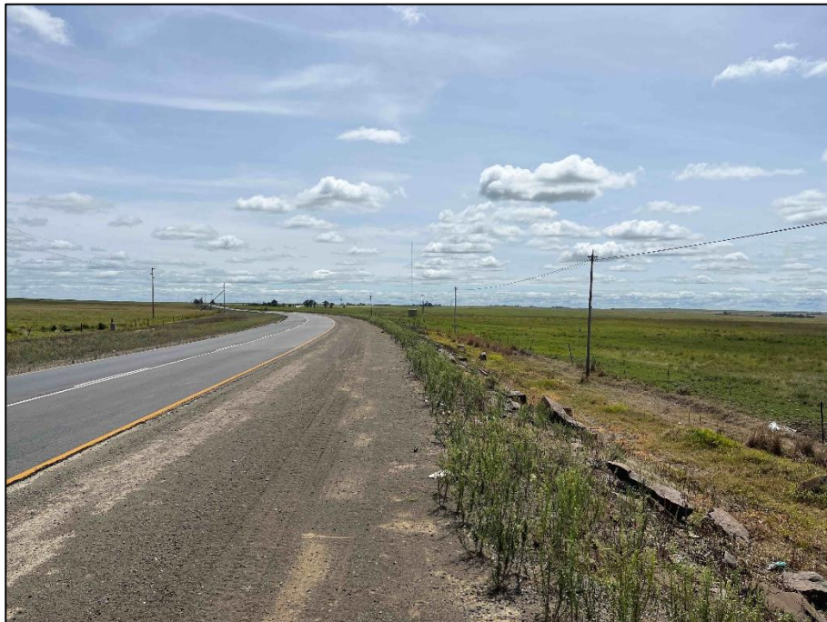
Figure 2: View north-east along District Road D823 showing slightly undulating terrain in the south-western sector of the study area