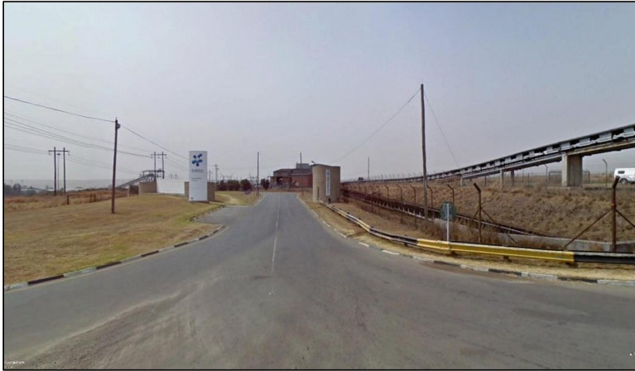
Figure 12: Substation and coal conveyor adjacent to the Riaan Rademan Training Academy

Final Basic Assessment Report: Proposed Development of a 132 kV Overhead Power Line and Supporting Infrastructure for the Proposed Vhuvhili Solar Photovoltaic Energy Facility, near Secunda in the Mpumalanga Province