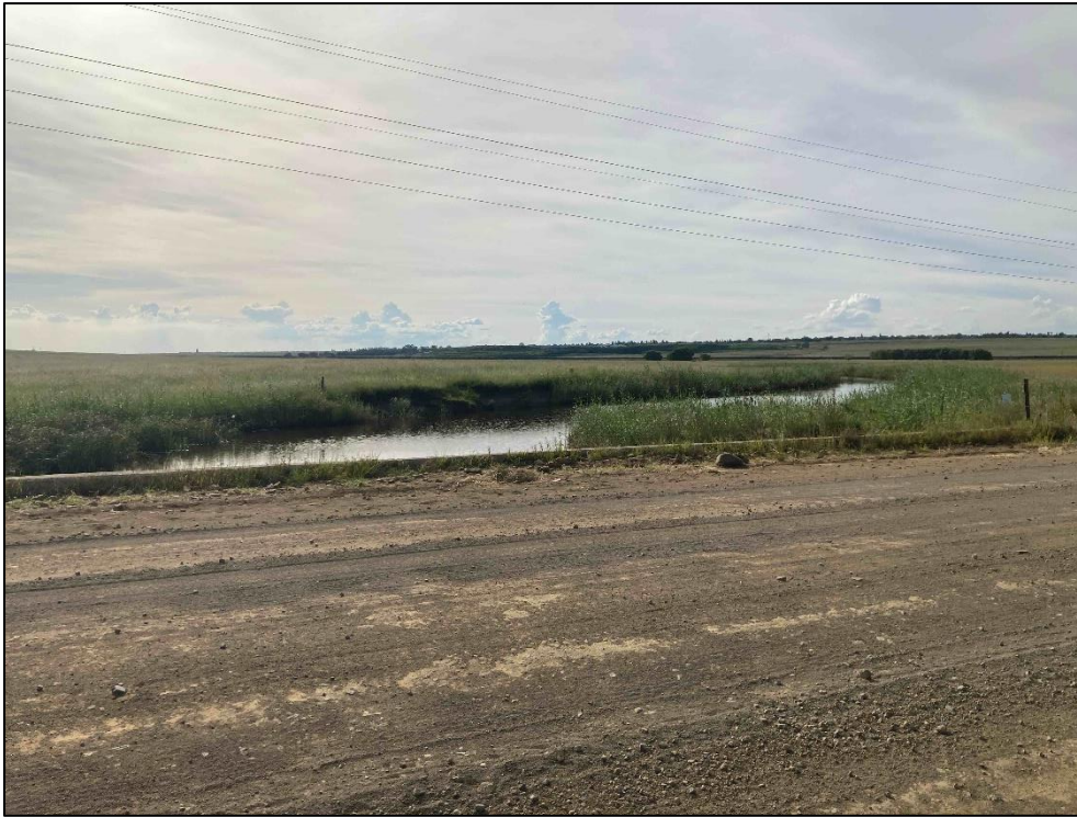
Figure 3: View of the Klipspruit River from District Road D823 in the northern sector of the study area.

Final Basic Assessment Report: Proposed Development of a 132 kV Overhead Power Line and Supporting Infrastructure for the Proposed Vhuvhili Solar Photovoltaic Energy Facility, near Secunda in the Mpumalanga Province