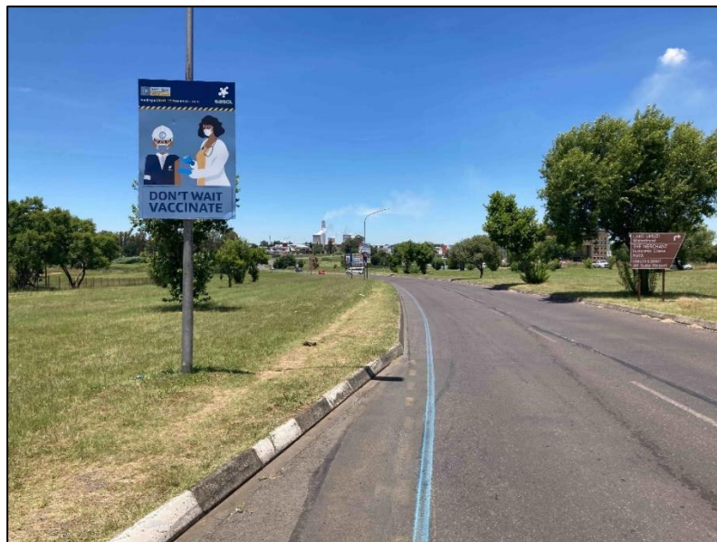
Figure 7: View southwards from Secunda towards the Sasol Fuel Plant

High levels of human influence are however visible in the northern and north-western sector of the study area. The town of Secunda ( Figure 7 ) lies immediately north-west of the study area and the peri-urban areas extending into the study area are dominated by industrial / mining activity ( Figure 8 ). In addition, the Sasol Secunda synthetic fuel plant ( Figure 9 ) is located on the western boundary of the study area, and this facility together with infrastructure related to the supply and storage of coal and electrical infrastructure ( Figure 10 ) has resulted in significant transformation in the landscape. Associated with the Sasol plant is the nearby Riaan Rademan Training Academy ( Figure 11 ) and adjacent electrical substation ( Figure 12 ), contributing further to the overall transformation of the landscape in this area.