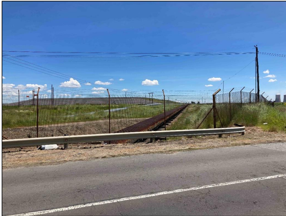
Figure 10: Infrastructure associated with the Sasol Plant

Final Basic Assessment Report: Proposed Development of a 132 kV Overhead Power Line and Supporting Infrastructure for the Proposed Vhuvhili Solar Photovoltaic Energy Facility, near Secunda in the Mpumalanga Province