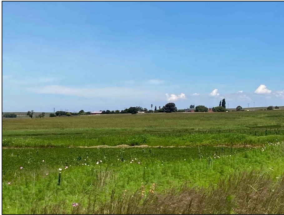
Figure 5: Typical example of tall trees planted around a farmhouse within the study area.

Final Basic Assessment Report: Proposed Development of a 132 kV Overhead Power Line and Supporting Infrastructure for the Proposed Vhuvhili Solar Photovoltaic Energy Facility, near Secunda in the Mpumalanga Province