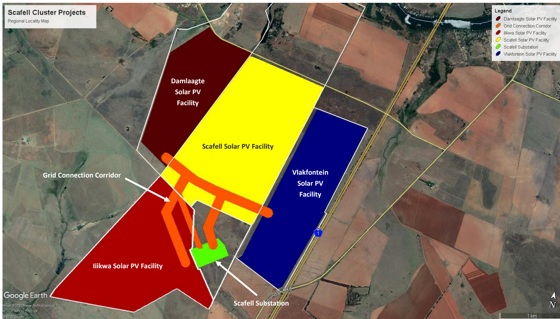
Figure 2-2: Local setting of the Scaffell Cluster projects in relation to the existing Scaffell Substation.