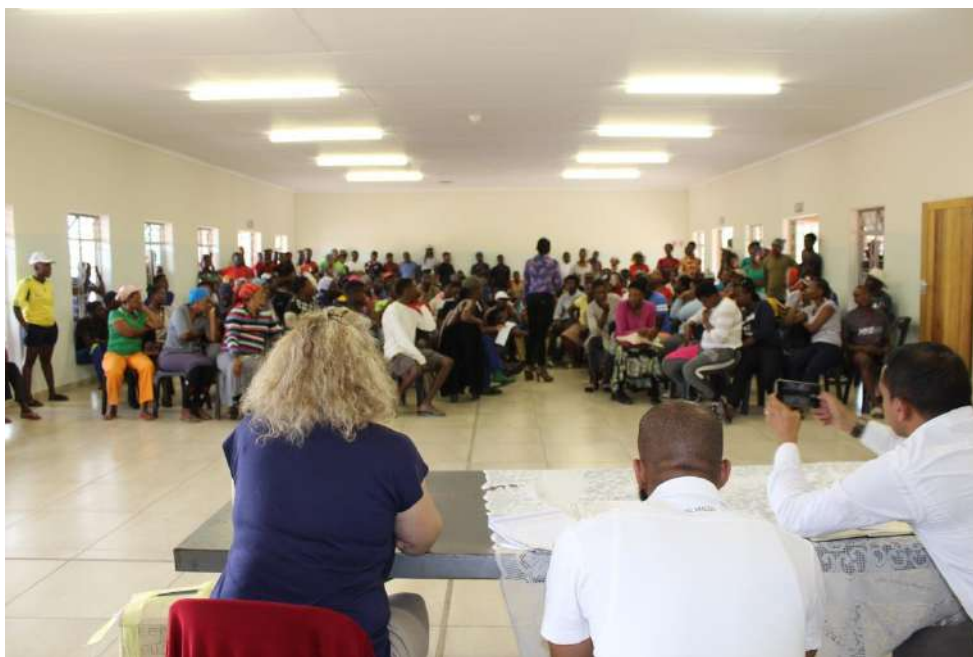
Figure 2: Community of Lesedi attending the Transnet Lephalale Railway Yard EIA public meeting on 13 February 2019 at the Lesedi Thusong Centre