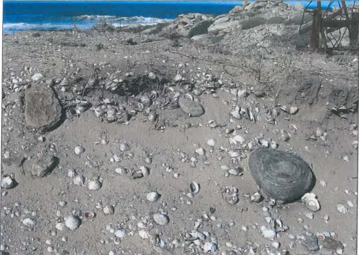
Figure 2 A late Stone Age shell midden situated close to Zwartlintjies Rivier.

The contribution of rock lobsters to the diet can be assessed on the basis of the number of mandibles found on the sites as these hard. Although lobster remains have been seen on most sites, observations so far indicate that sites suspected to be older than 1800 years show markedly higher mandible counts.