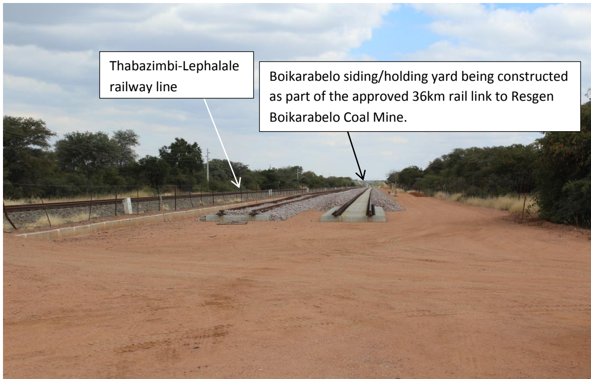
Figure 1: View of existing Thabazimbi-Lephalale single railway (left) and the Boikarabelo Coal Mine’s 100 wagon train holding yard being constructed as part of their approved 36km rail link (right). Photo taken facing south west towards Geelhoutkloof 359LQ