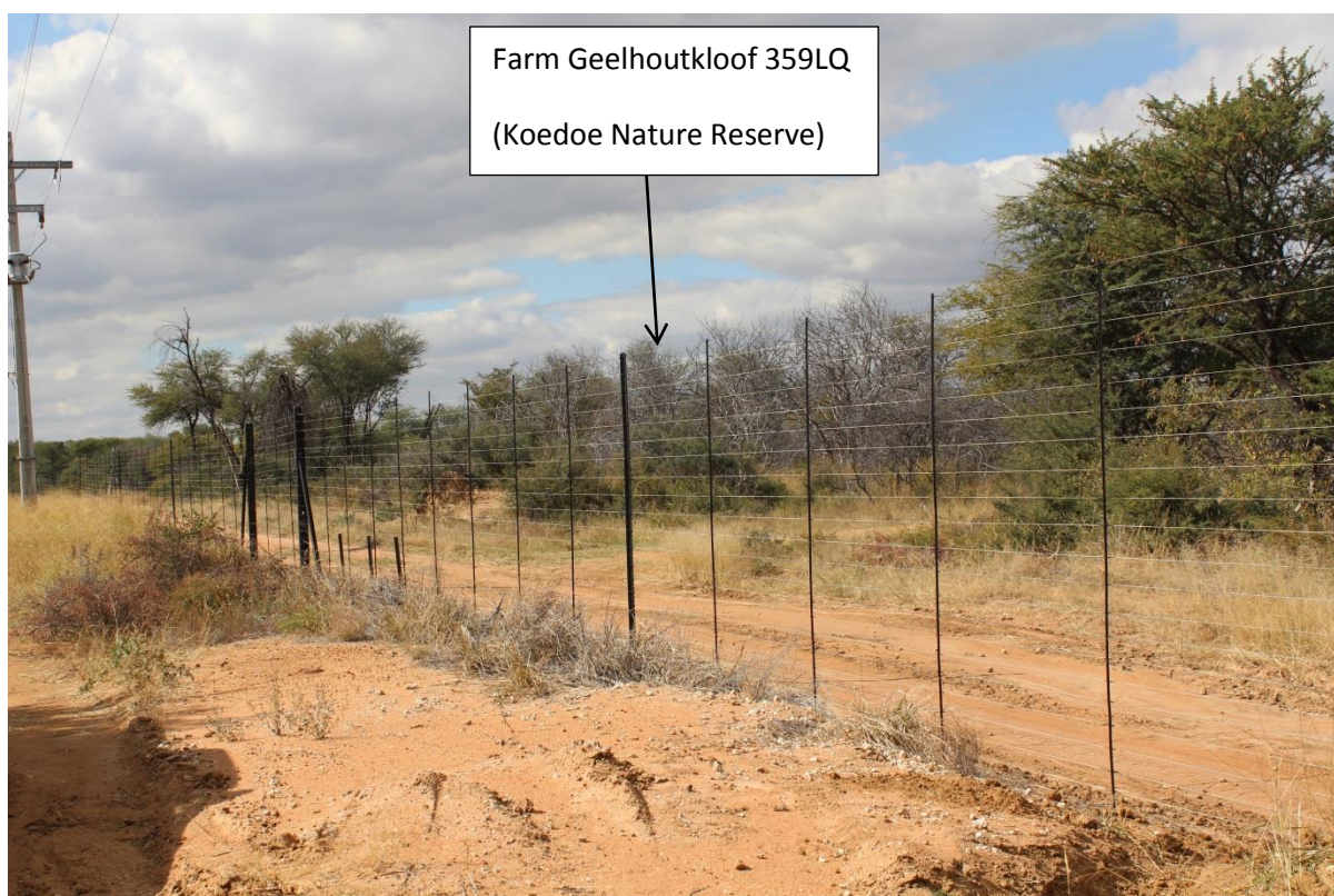
Figure 4: View to the south east (south) of the existing railway track where the railway yard is proposed. The project site is covered in indigenous bushveld vegetation and several protected tree species.