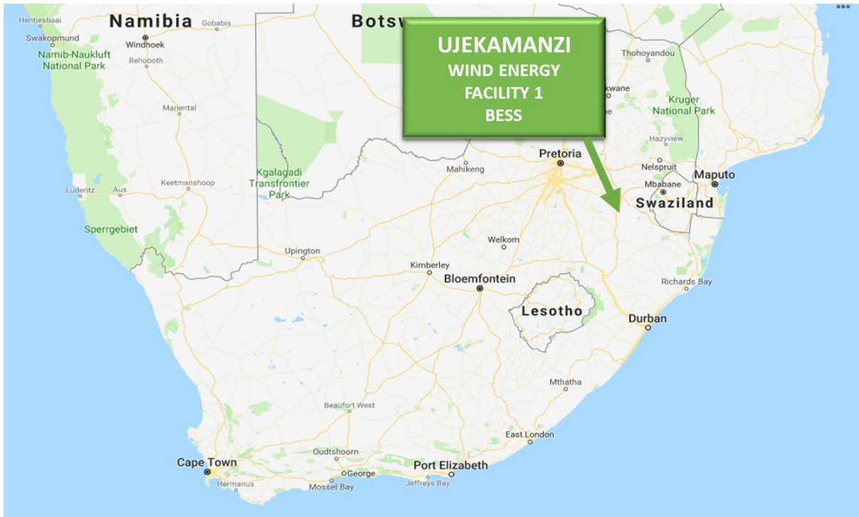
Figure 1: Map showing the location of the proposed Ujekamanzi Wing Energy Facility 1

This report serves as the High-Level Safety and Health Risk Assessment for the Battery Energy Storage Facility that was prepared as part of the Scoping and Environmental Impact Assessment (S&EIA) for the proposed development of a Wind Energy Facility (Ujekamanzi Wind Energy Facility 1) and associated infrastructure, south of Ermelo, in the Dr. Pixley Ka Isaka Seme Local Municipality within the Mpumalanga Province.