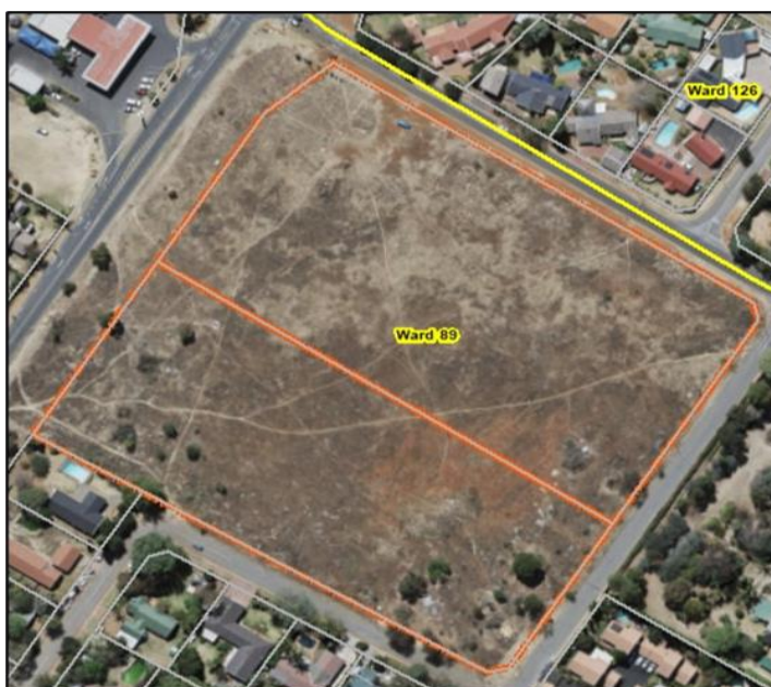
Figure 1: Proposed Project Area

The project area is currently vacant, however, there is informal trading that is taking place on a small portion of the site. No CBAs, ESAs, protected areas or watercourses have been identified within the project area.