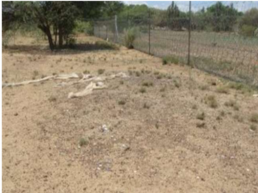
A view of a section of the midden.

Anton Pelser APELSER ARCHAEOLOGICAL CONSULTING cc 083 459 3091