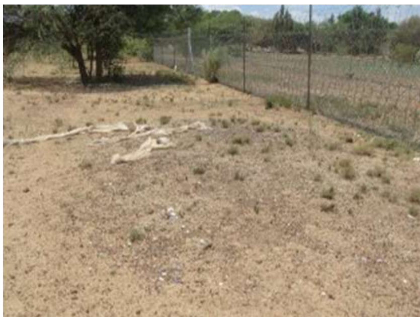
A view of a section of the midden.

Anton Pelser APELSER ARCHAEOLOGICAL CONSULTING cc 083 459 3091