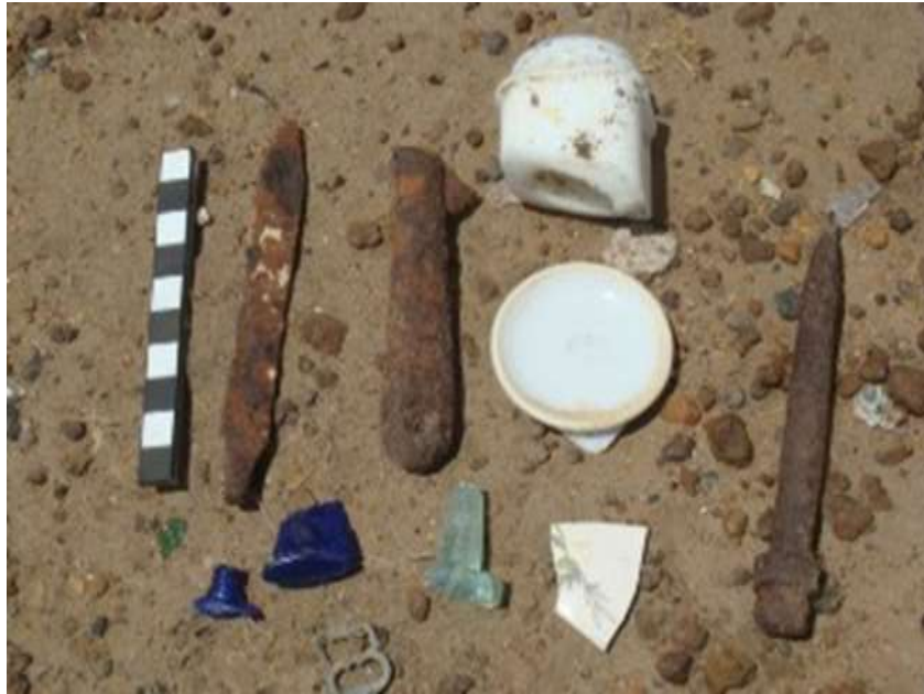
Some of the cultural material from the site. Included here is a pocket knife and a bottle stopper typical of the late 19th/mid 20th century.