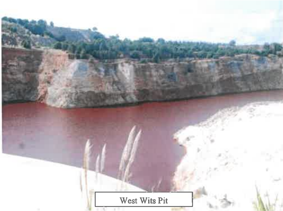
West Wits Pit