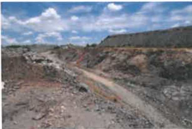
16 February 2018