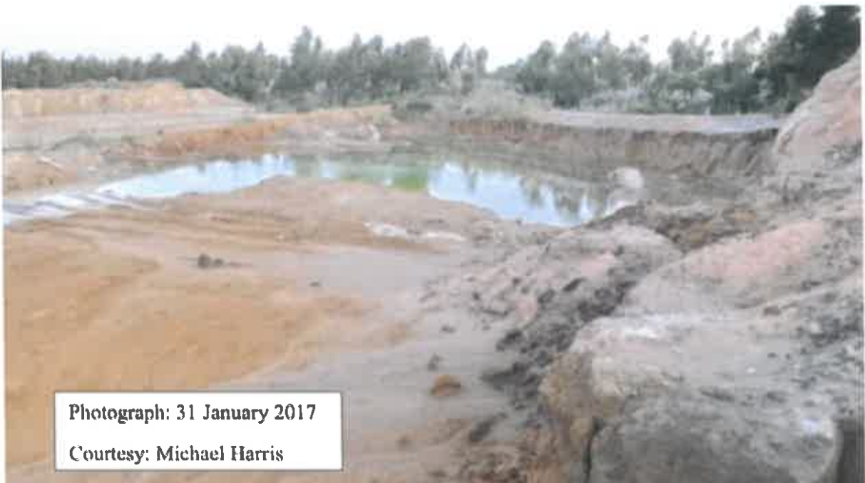
Photograph: 31 January 2017