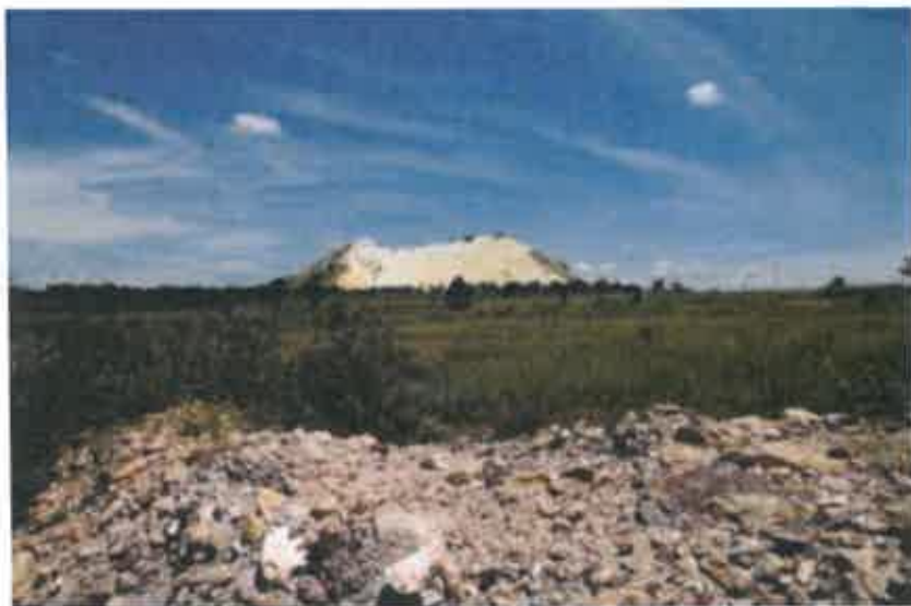
(16 February 2018)