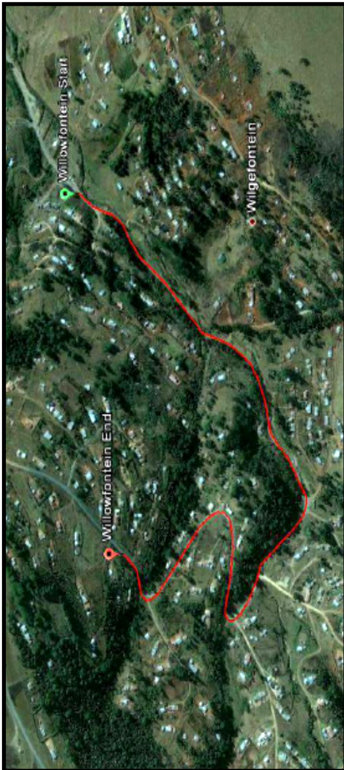
Figure 1. Google Aerial map showing the location of the proposed Willowfountain Road Upgrade (in red) situated in Edendale.