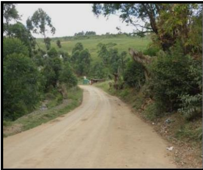
Figure 4. Photograph of Willowfountain Road