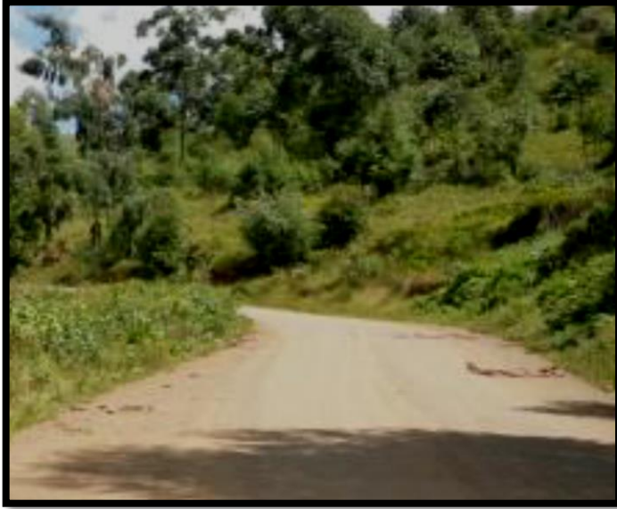
Figure 3. Photograph of Willowfountain Road