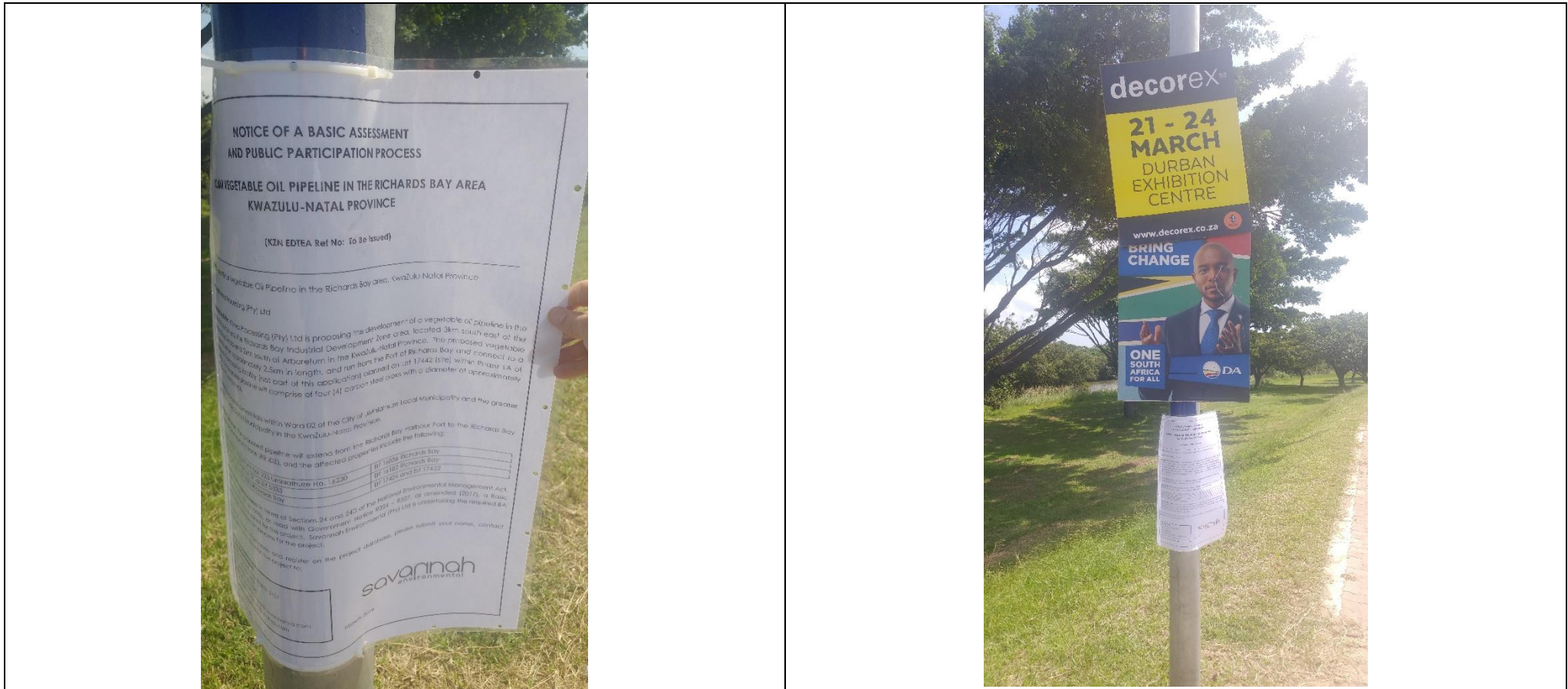
Figure 2: Site notice placed on Medway Road, Richards Bay (28° 48' 19.88" S / 32° 4' 4.25" E).