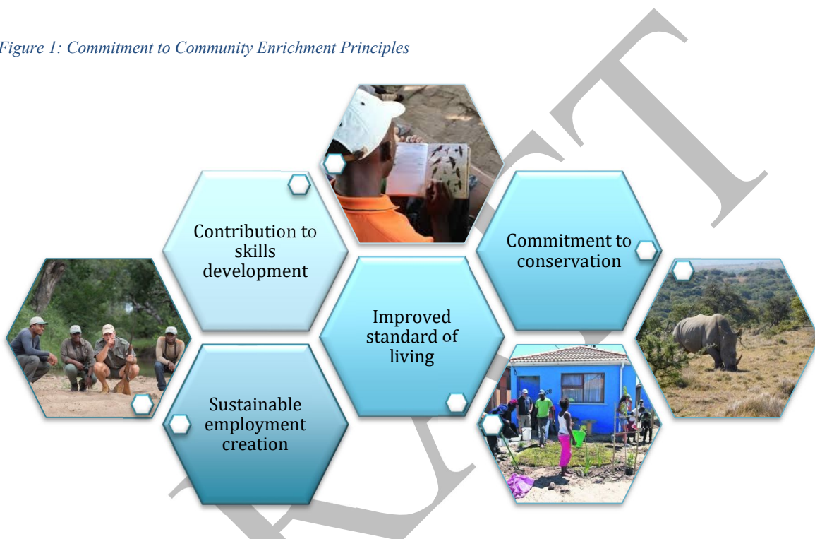
Figure 1: Commitment to Community Enrichment Principles

Wind Energy Facilities, like any development, provide for an opportunity to enrich the communities in which the WEF are to be located. This section of the report considers selected socio-economic and conservation-related enrichment principles that guide the conceptualisation of the proposed conservation framework. The principles are diagrammatically presented in Figure 1.