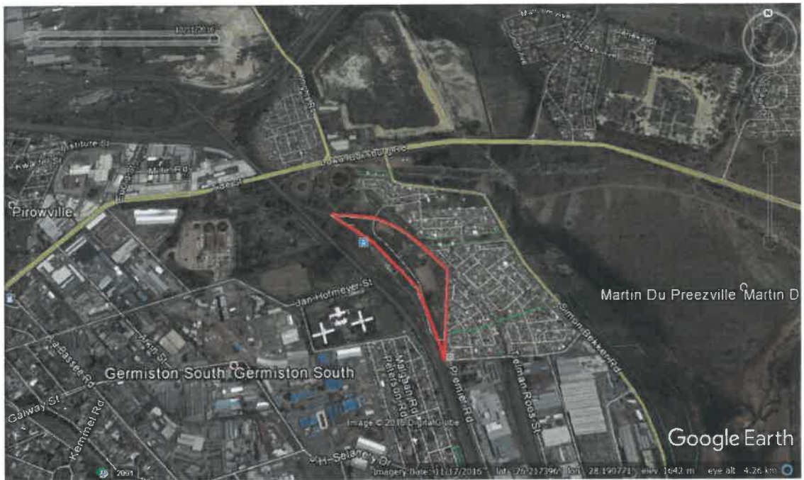
— The site

The area directly east of the site is developed for residential purposes and the areas to the north and south is Industrial in nature. A railway line forms the western boundary of the site.