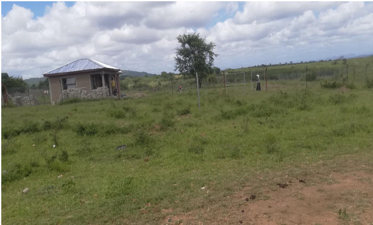
House without electricity