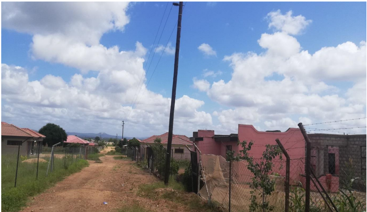
The existing powerlines and electrified houses on site