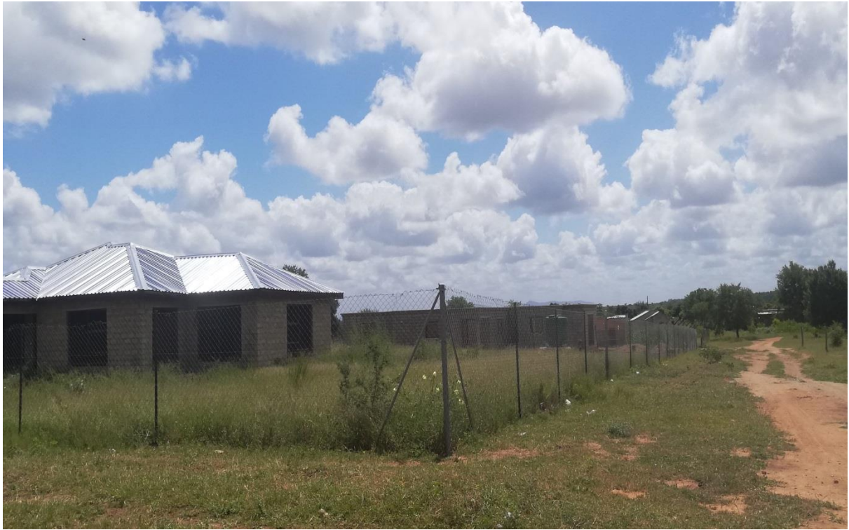
New build houses without electricity