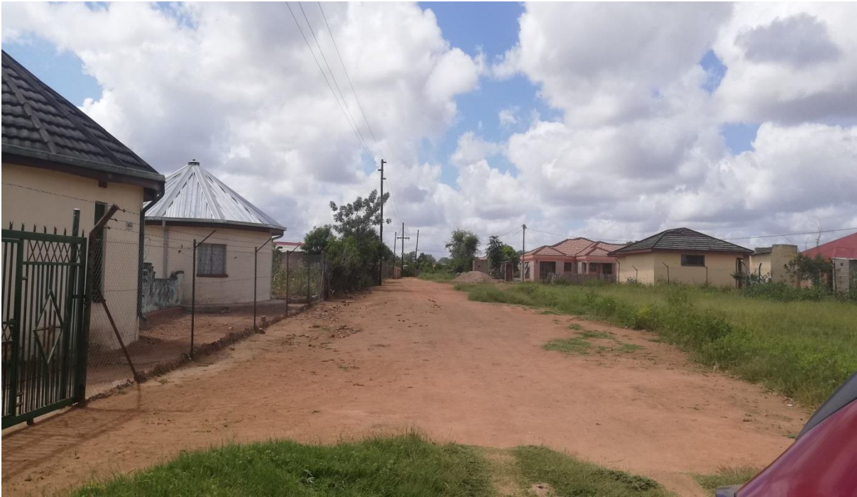
Existing powerline and gravel road