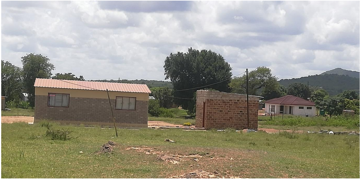
Houses that need proper connection