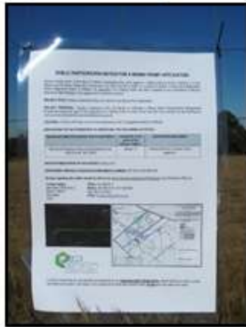
Site Notice 3