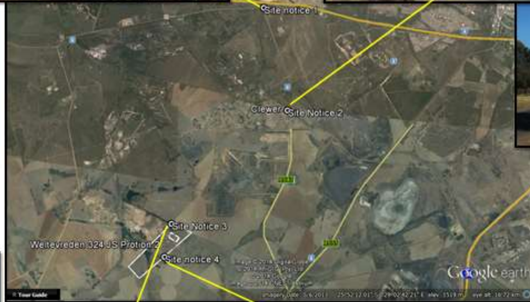
Site Notice 3