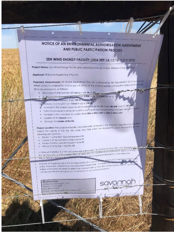
Figure 3: Site Notice placed at the entrance gate of Site Notice placed on the boundary fence of Remain-der of Portion 1 of the of the Farm Moolenaars Drift 85 along the R44 (on either side of the R44).

Co-ordinates: 33°13'22.6"S / 18°58'24.5"E