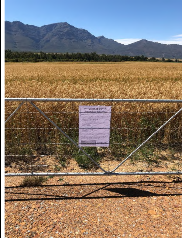
Figure 4: Site Notice placed at the entrance gate of Site Notice placed on the boundary fence of Remain-der of Portion 1 of the of the Farm Moolenaars Drift 85 along the R44 (on either side of the R44)

Co-ordinates: 33°13'22.6"S / 18°58'24.5"E