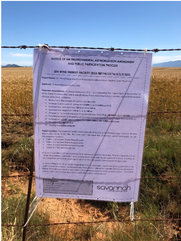
Figure 1: Site Notice placed on the boundary fence of Portion 9 of the Farm Hartebeeste kraal 88

Co-ordinates: 33°15'29.4"S / 18°58'09.5"E