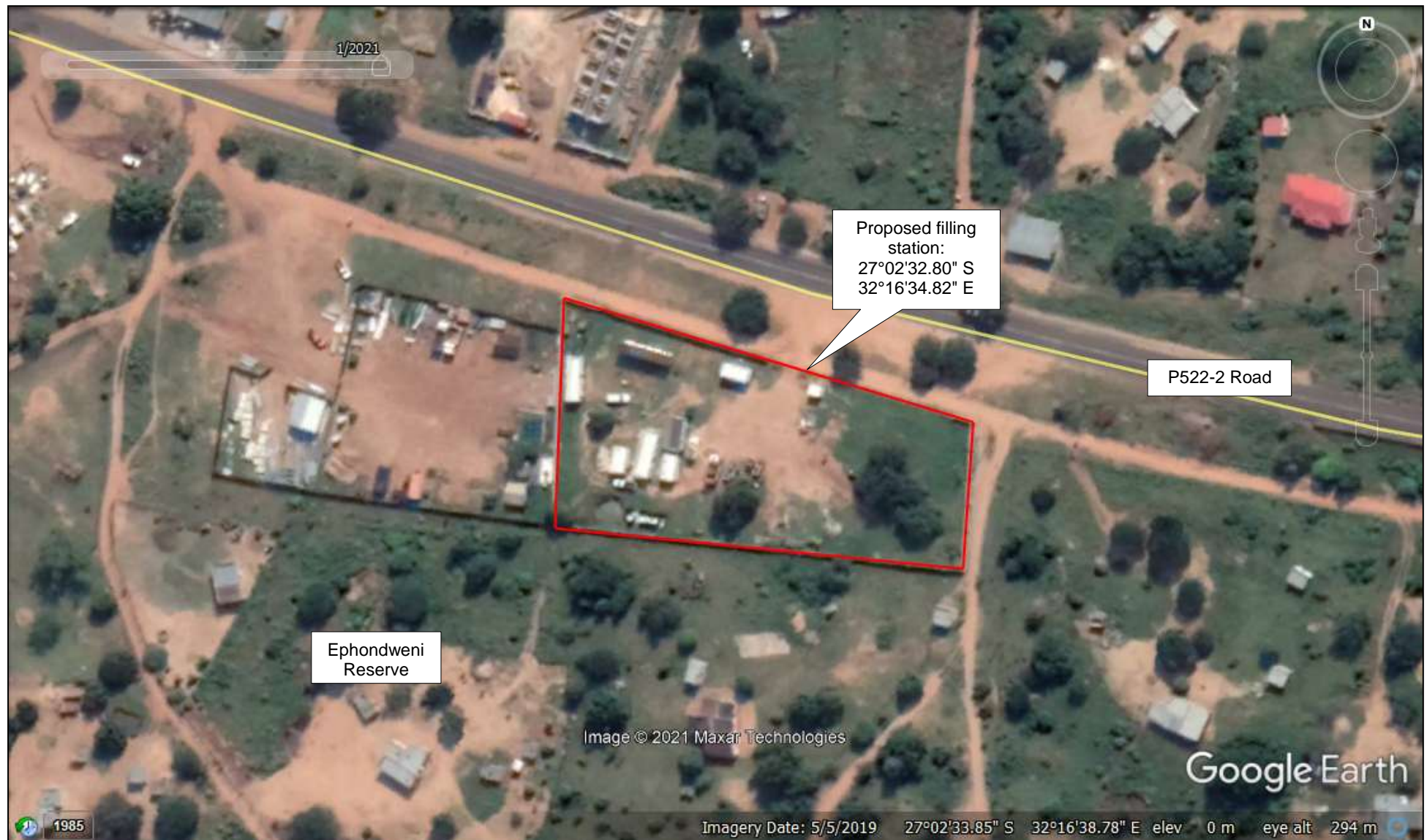
Figure 3: Map showing the proposed project, Ephondweni Reserve, KwaZulu-Natal.