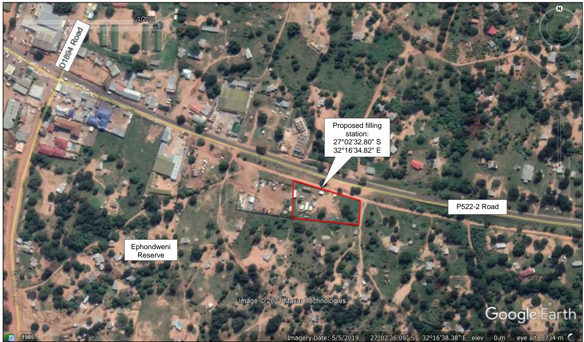
Figure 2: Map showing the proposed project, Ephondweni Reserve, KwaZulu-Natal (Source: Google Earth).