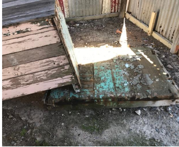
Discarded cupboards in a shed close to the warden's homes