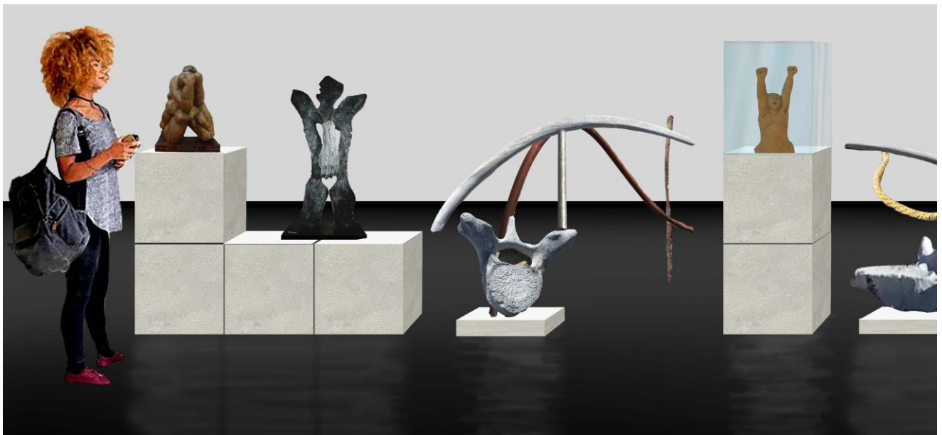
Artist impression of found objects to be used in the departure area of the NMG. The found objects are to be displayed along with sculpture from the Robben Island Collection.