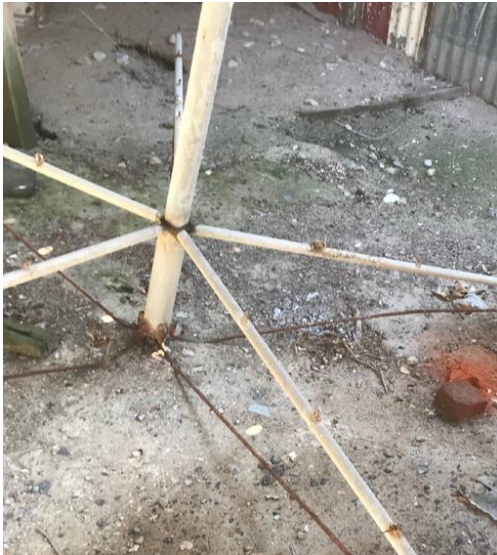
discarded metal washing line