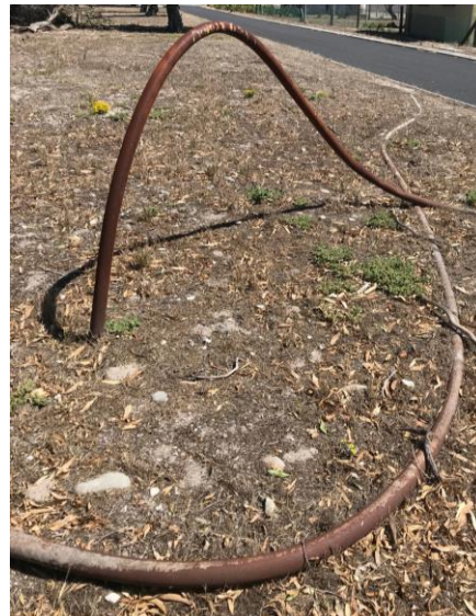
Rusted mild steel tubing