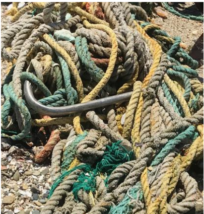
Ropes and cables