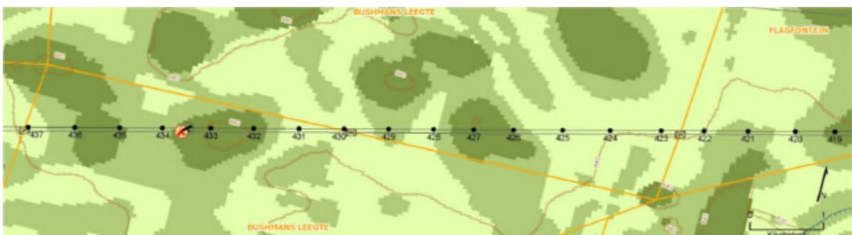
Figure 1: Example of an environmental sensitivity map in the context of a final overhead transmission and distribution profile

This sub-section must include a map of the site sensitivity overlaid with the preliminary infrastructure layout. The sensitivity map must be prepared from the national web based environmental screening tool, when available for compulsory use at: https://screening.environment.gov.za/screeningtool . The sensitivity map shall identify the nature of each sensitive feature e.g. raptor nest, threatened plant species, archaeological site, etc. Sensitivity maps shall identify features both within the planned working area and any known sensitive features in the surrounding landscape. The overhead transmission and distribution profile shall be illustrated at an appropriate resolution to enable fine scale interrogation. It is recommended that <20 km of overhead transmission and distribution length is illustrated per page in A3 landscape format. Where considered appropriate, photographs of sensitive features in the context of tower positions shall be used.