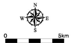
Map 1: Comparative Viewshed Analysis – Zonnequa Wind Farm.