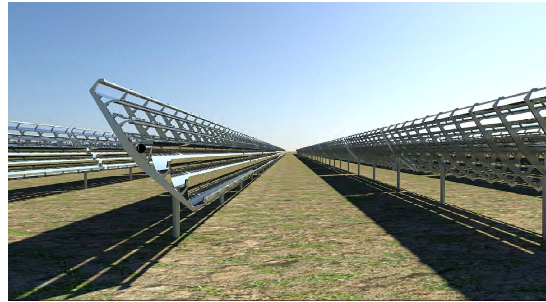
2 TRACKER 3D VIEW SCALE: NTS