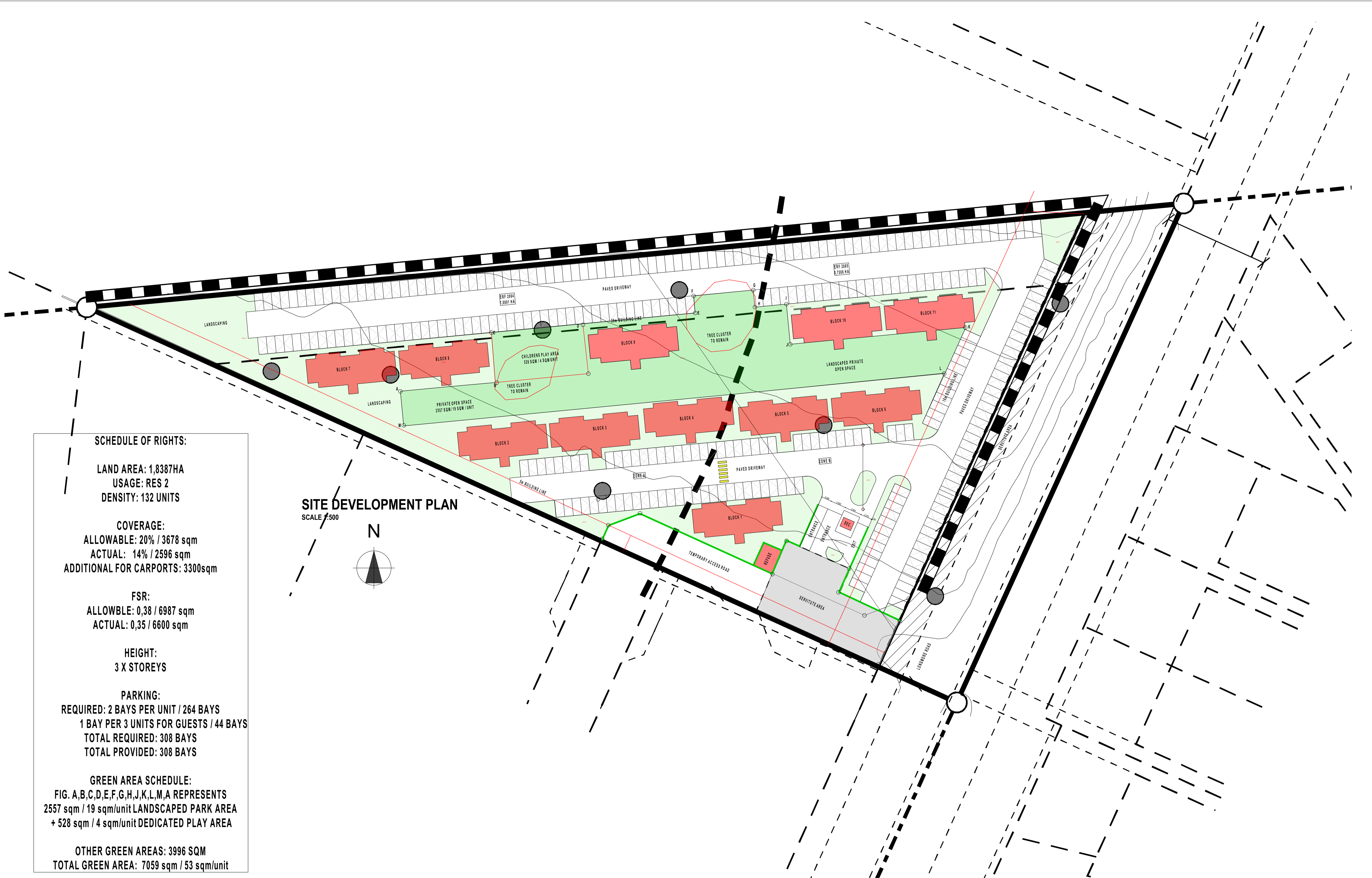
SITE DEVELOPMENT PLAN SCALE: 1:500