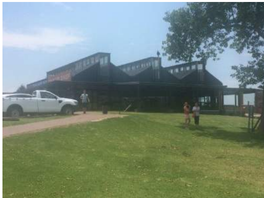
Service Station, Midlands