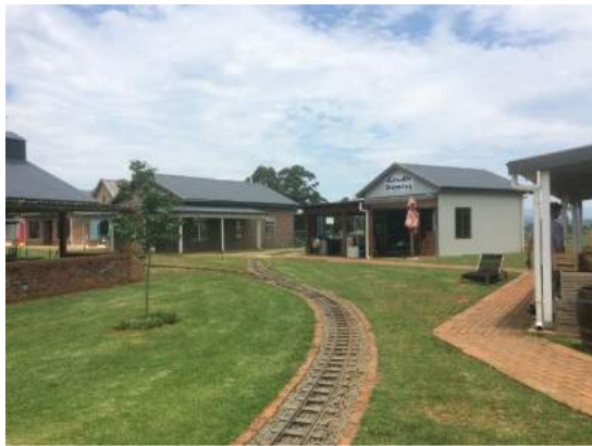
Piggly Wiggly Commercial Centre, Midlands