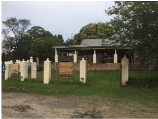
Neighbour- "Monsoon Moon"