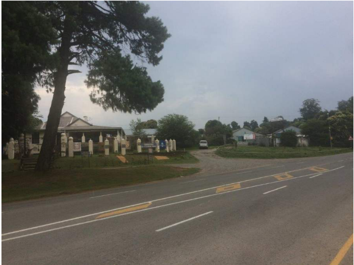
Entrance to the site from the R103