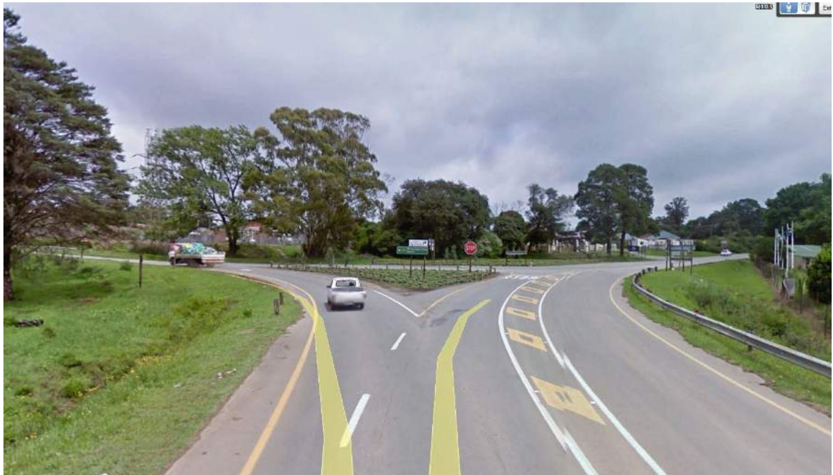
R103, approach from the south