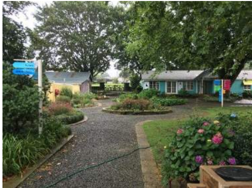
Neighbour opposite R103: Shopping Village