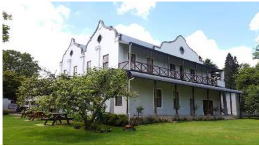
Neighbour- Nottingham Road Hotel