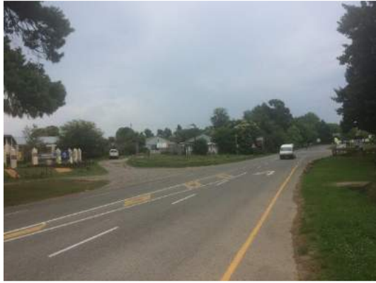
Access from the R103