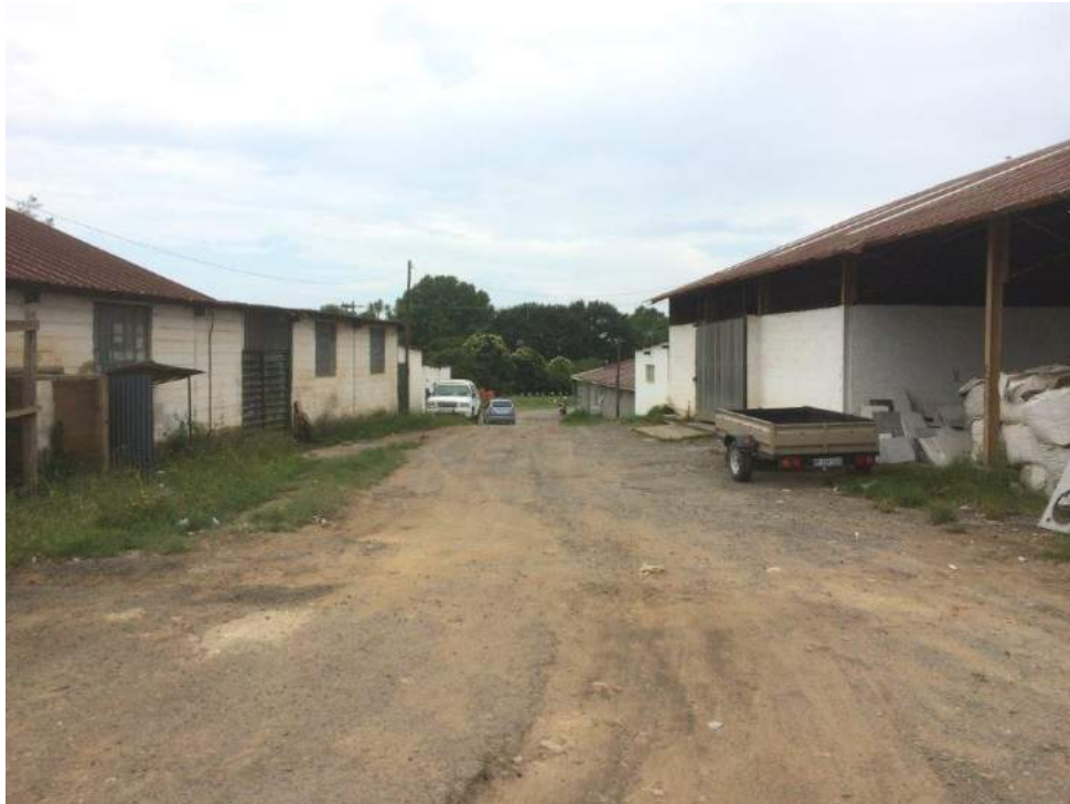
View down existing dirt road in centre of site