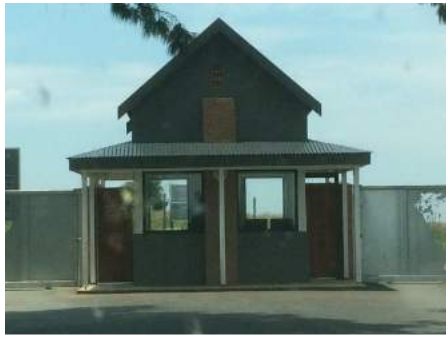
Brahman Hills Estate, Mount West