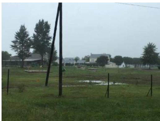
Neighbour opposite R103: Gowry Estate