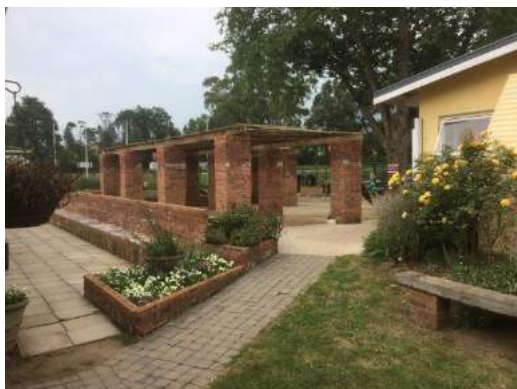
Neighbour opposite R103: Shopping Village