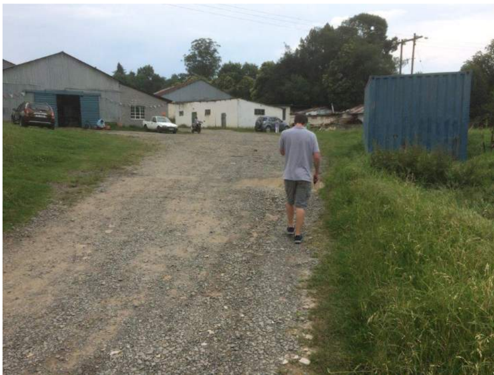
View from entrance road from the R103 onto the site.