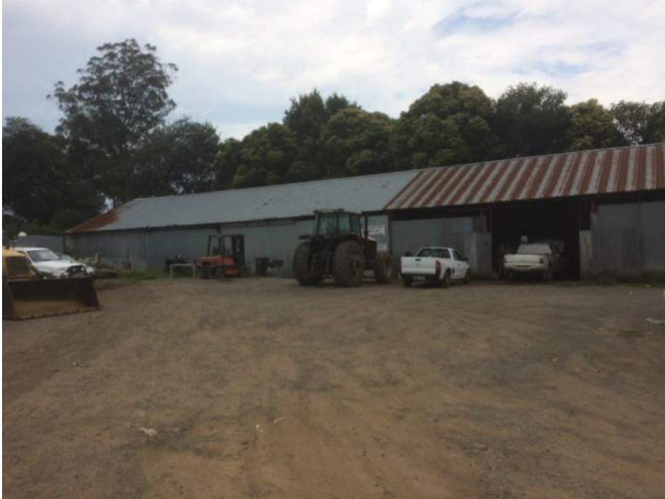
View towards the Northern Corner of Site