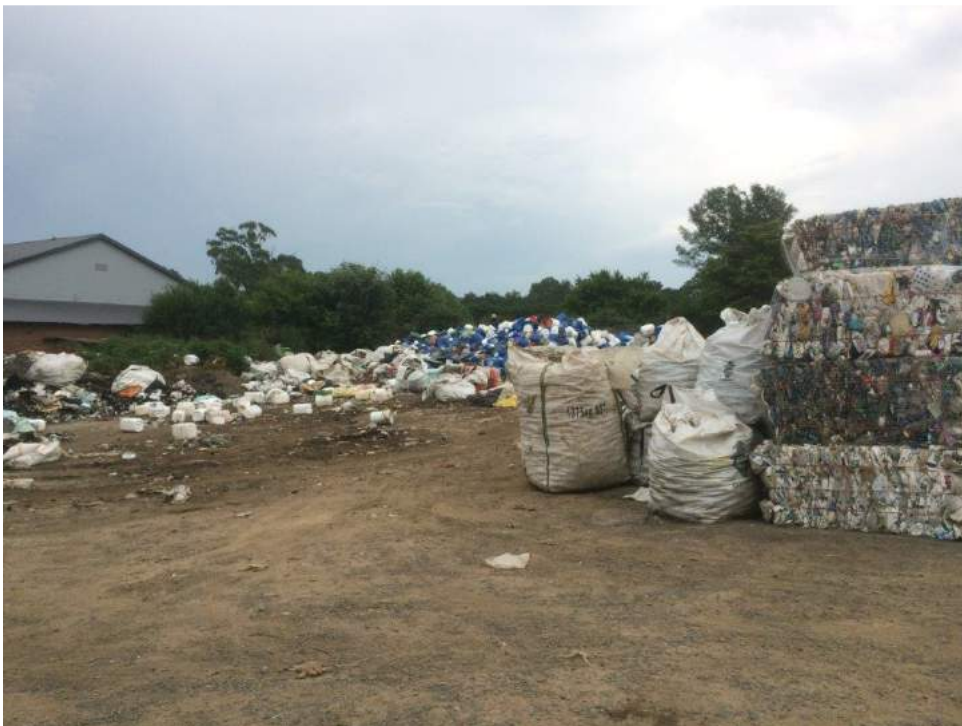
View towards the Western Corner of Site