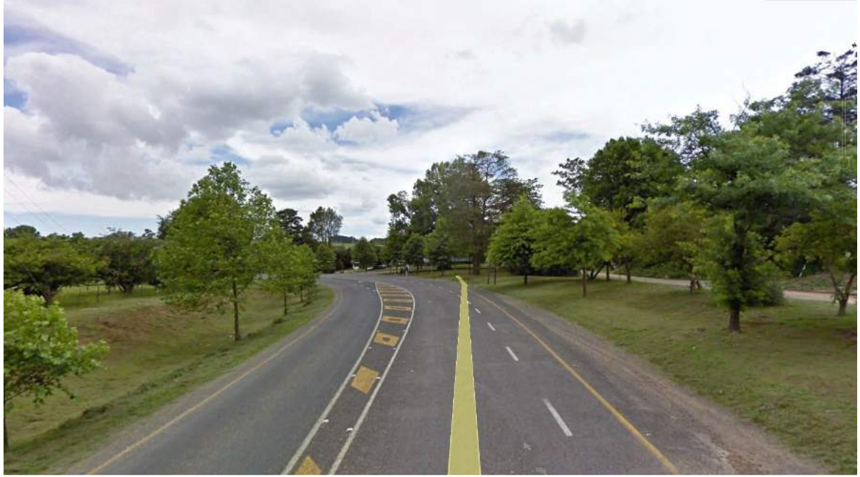
R103, approach from the North