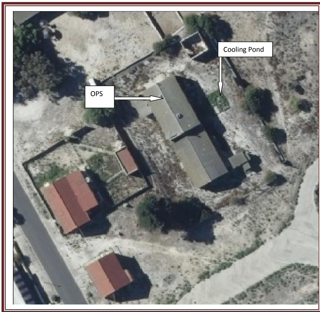
Fig. 1. Ortho photo April 2010 showing green square of vegetation.