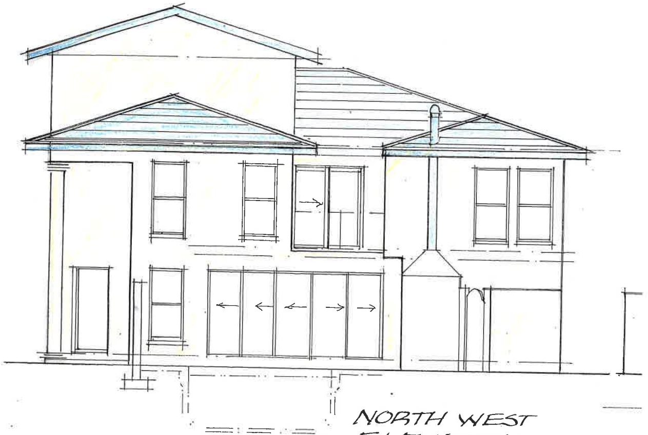
NORTH WEST ELEVATION 1:100