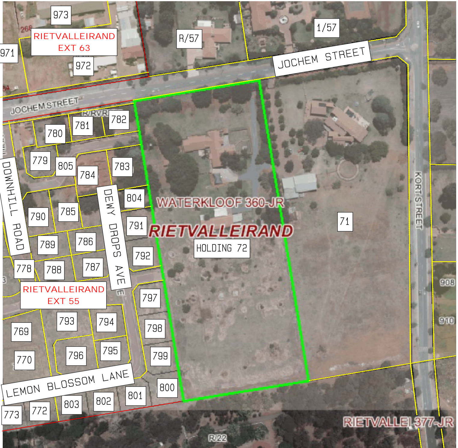
FIGURE 1b: LOCALITY IN LOCAL CONTEXT