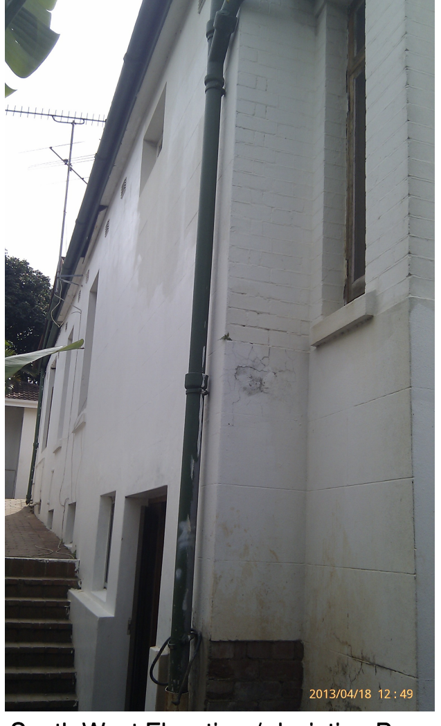
South West Elevation / deviation B