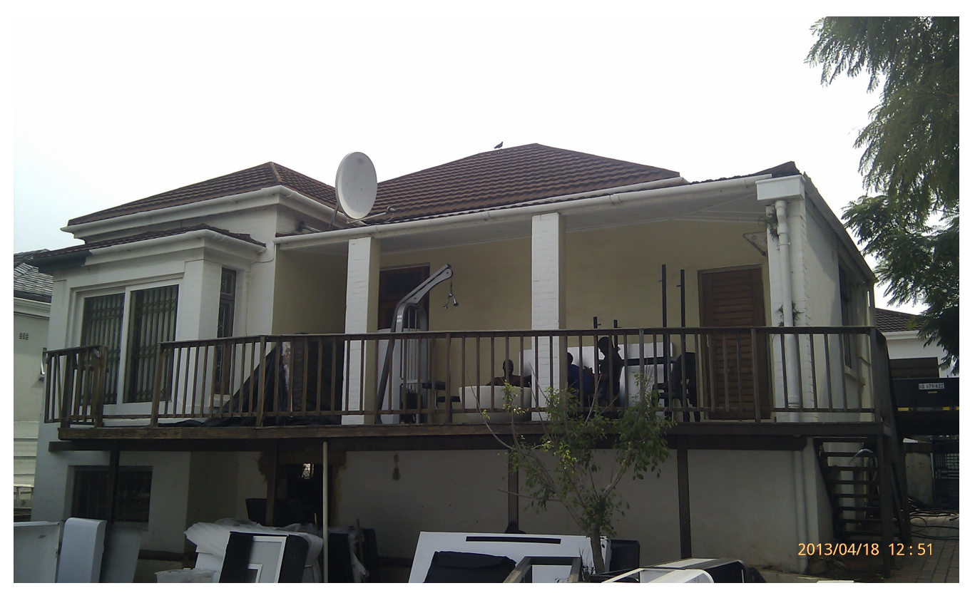
Main House / South East Elevation / deviation A