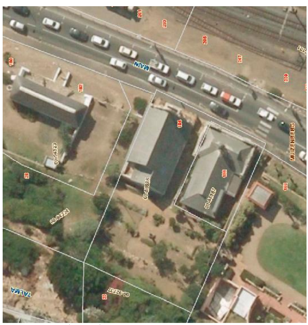
Figure 1: Aerial view of site on 186 Main Road, Muizenberg