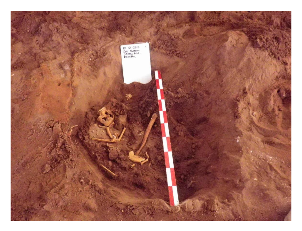
Figure 3: Skeletal elements in situ – surrounding soil is pristine having no building rubble or showing any disturbances from past building operations on site.