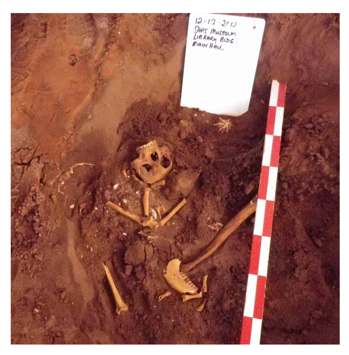
Figure 5: Close up of damage inflicted on skeletal material by builders on site