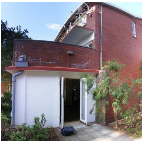
(10.) WEST FAÇADE