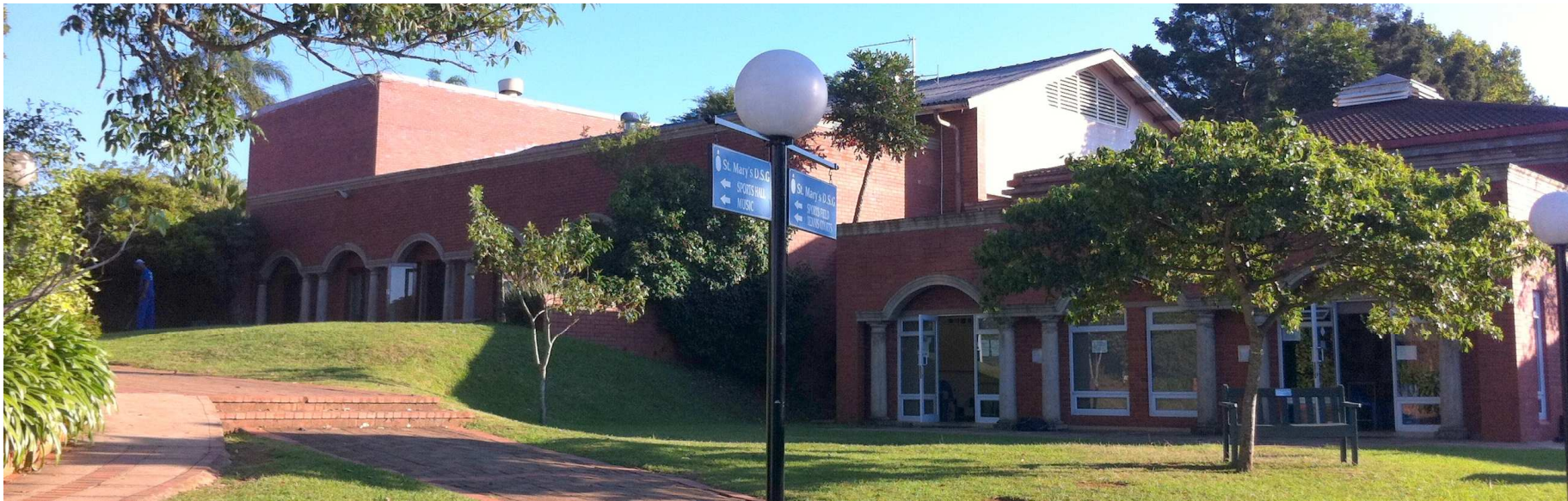
(E) ASSEMBLY HALL & THE STUDIO (South Façade)