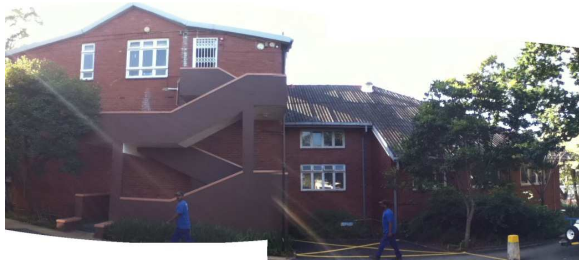
(11.) WEST FAÇADE