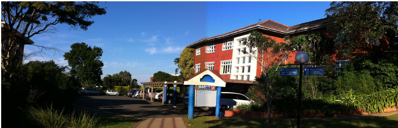
(8.) EAST FAÇADE & SURROUNDS