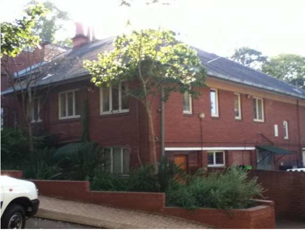
(1.) SOUTHWEST CORNER