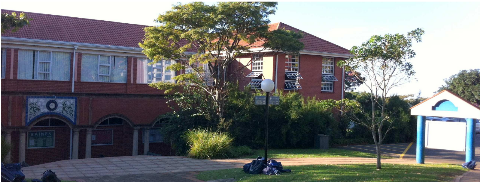
(F) HENLEY HOUSE CLASSROOMS (West Façade)