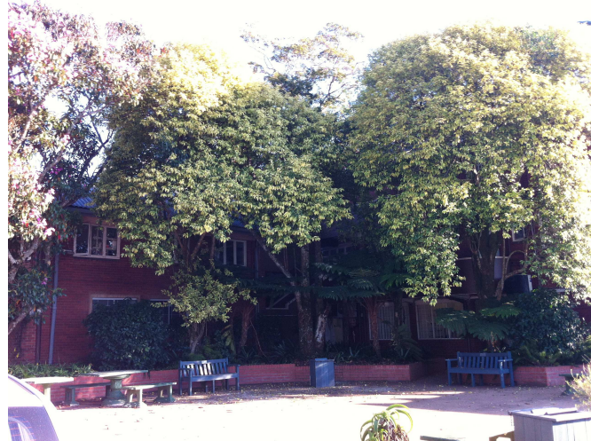
(4.) SOUTHEAST – Part Facade