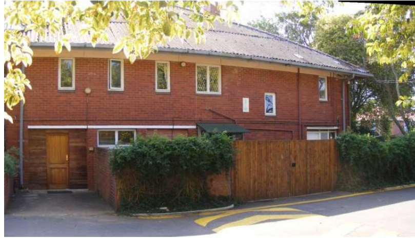
(2.) SOUTH FAÇADE