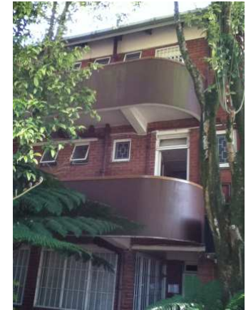
(5.) SE - Part Façade