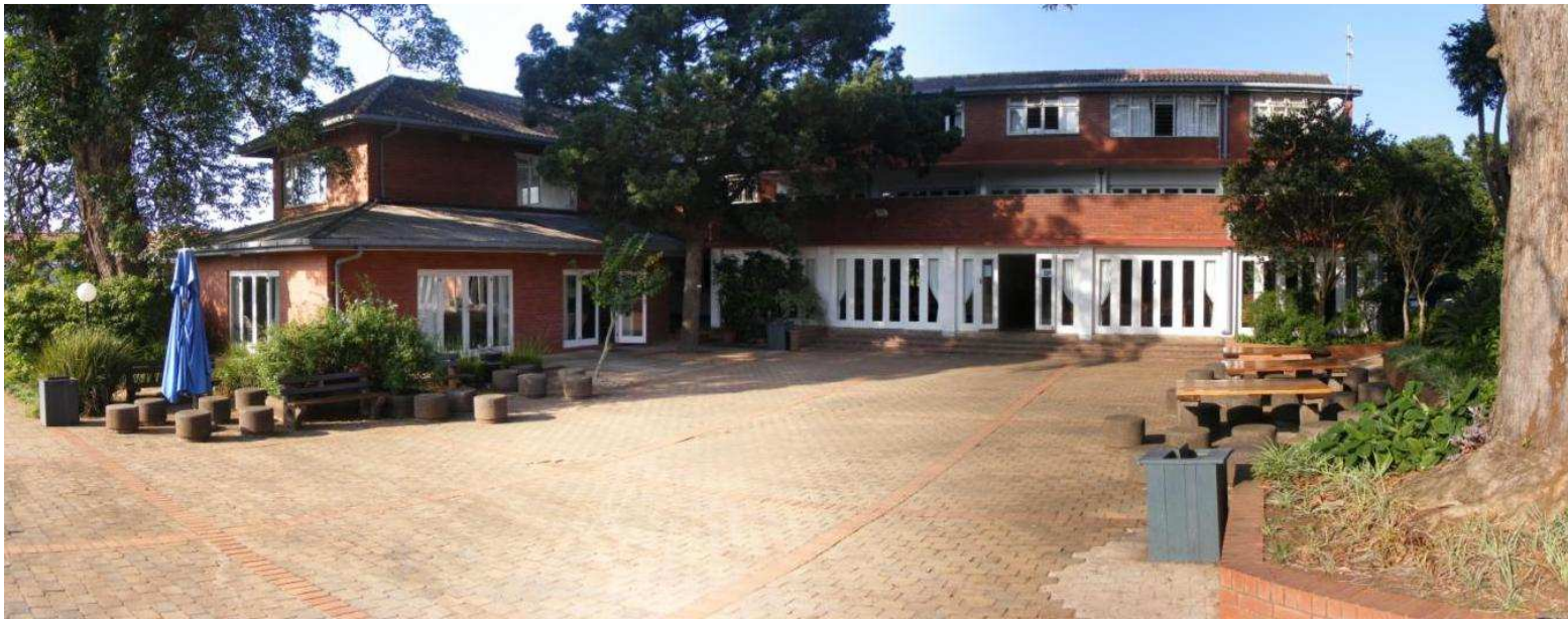
(9.) NORTH FAÇADE