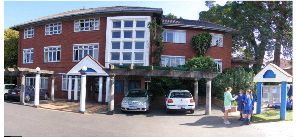
(7.) EAST FAÇADE