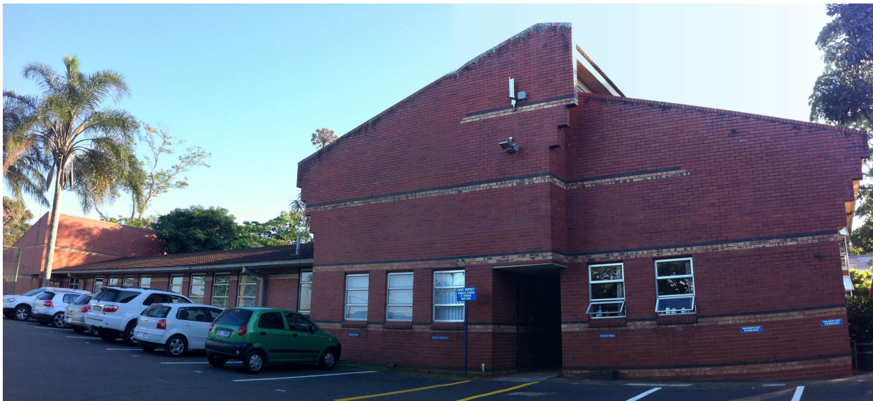
(B) LEARNING RESOURCES CENTRE (South Façade)