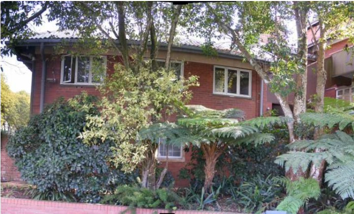
(3.) EAST - Closeup