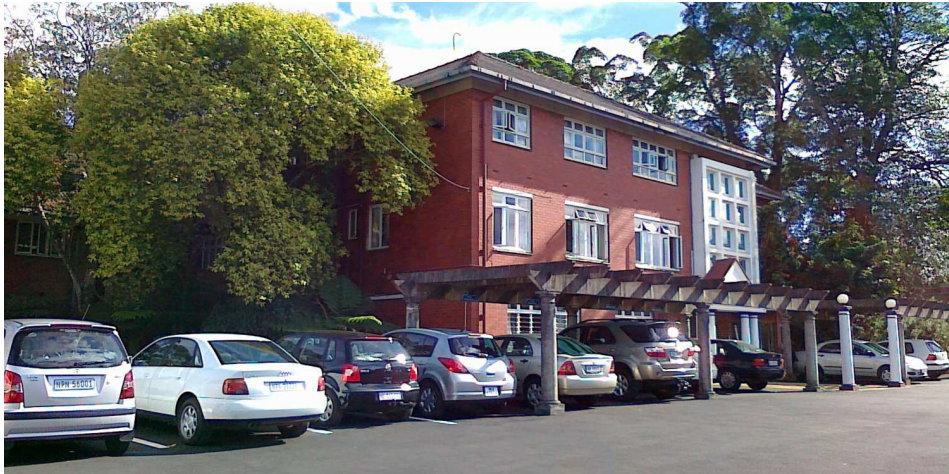
(6.) EAST FAÇADE