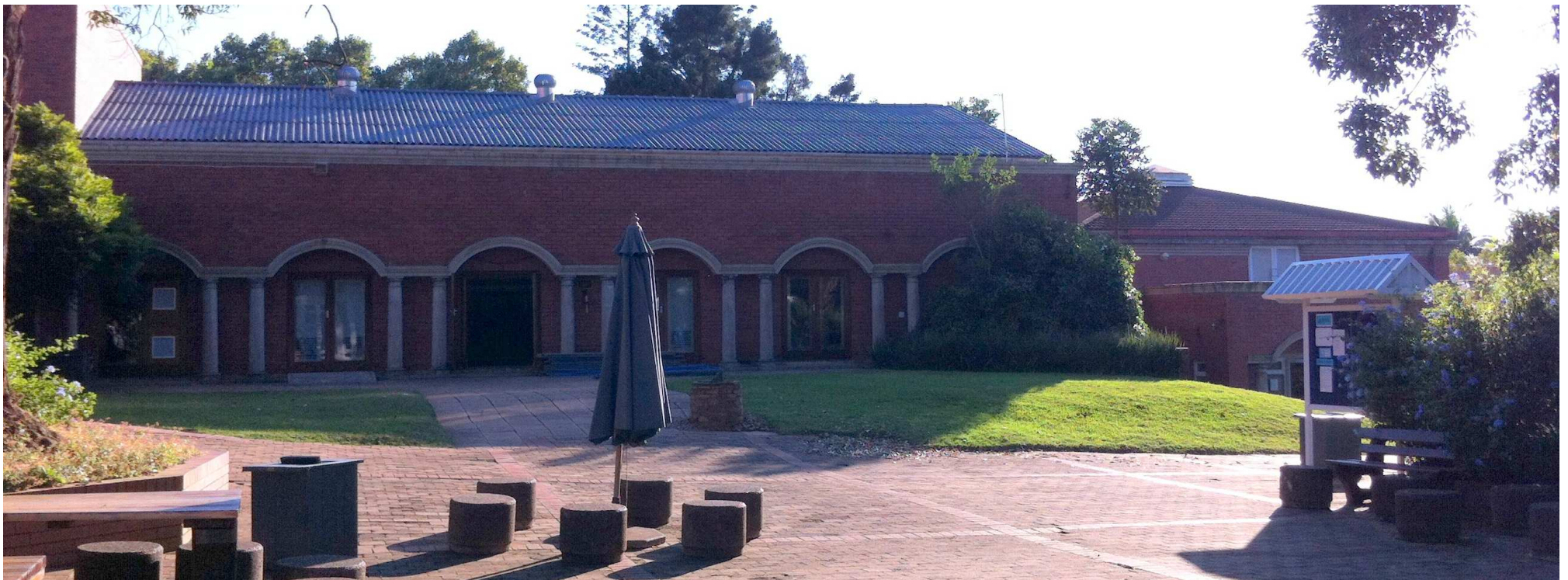
(D) ASSEMBLY HALL (South Façade)