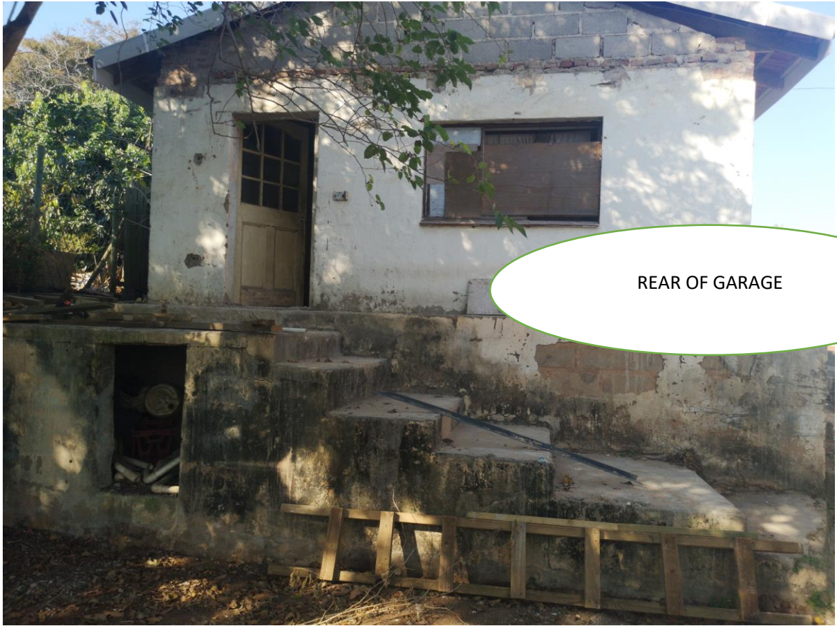
REAR OF GARAGE