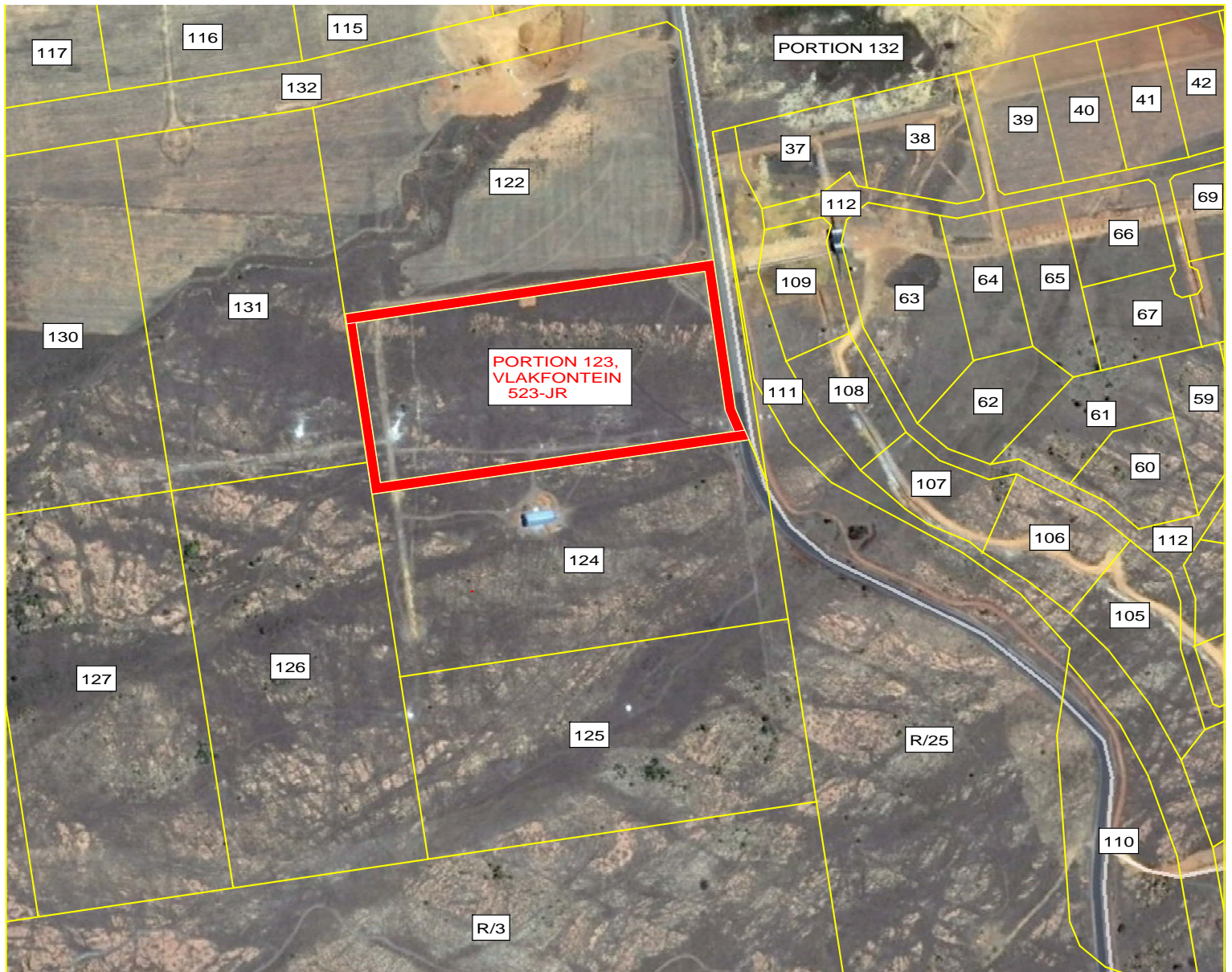
FIGURE 1b: LOCALITY IN LOCAL CONTEXT