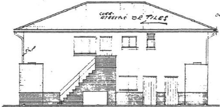
- REAR ELEVATION -