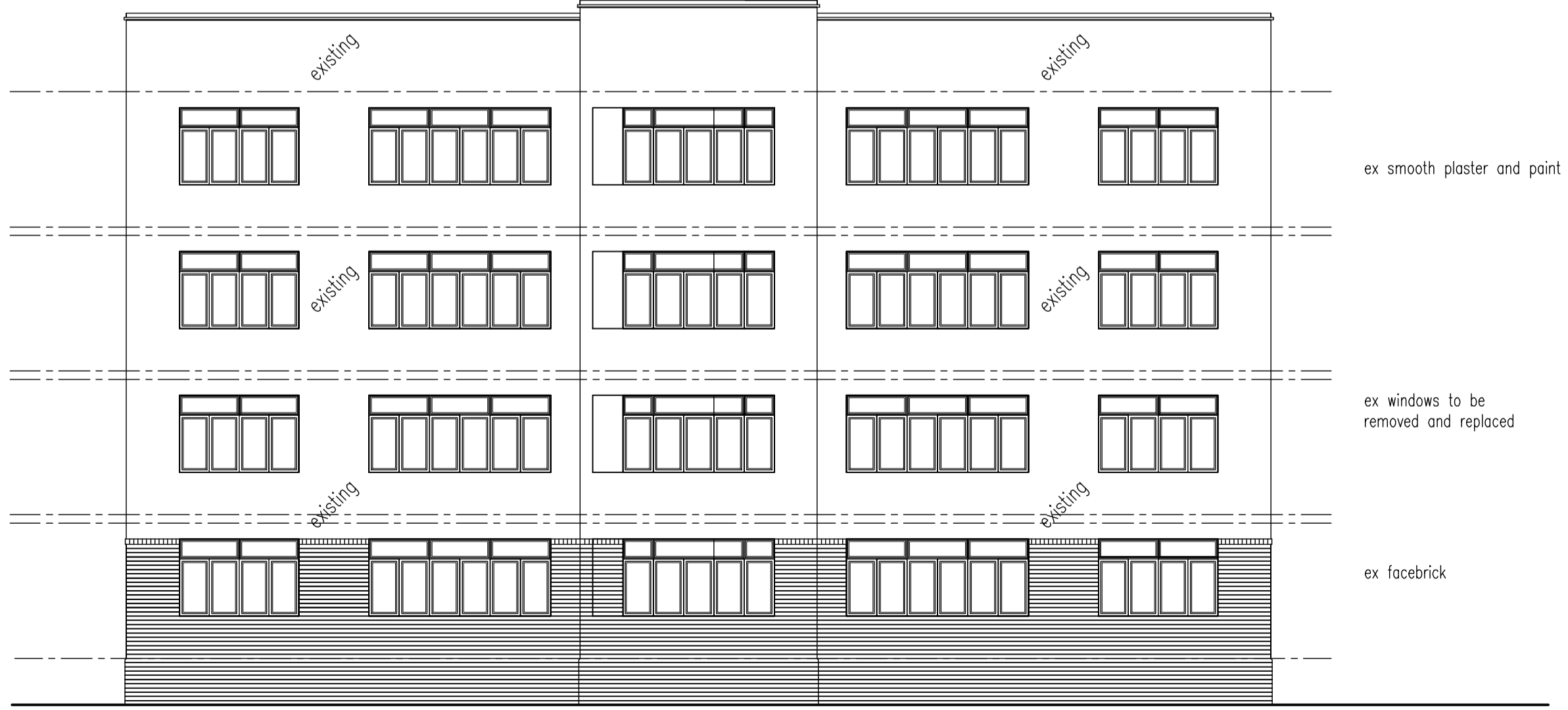
south east elevaion