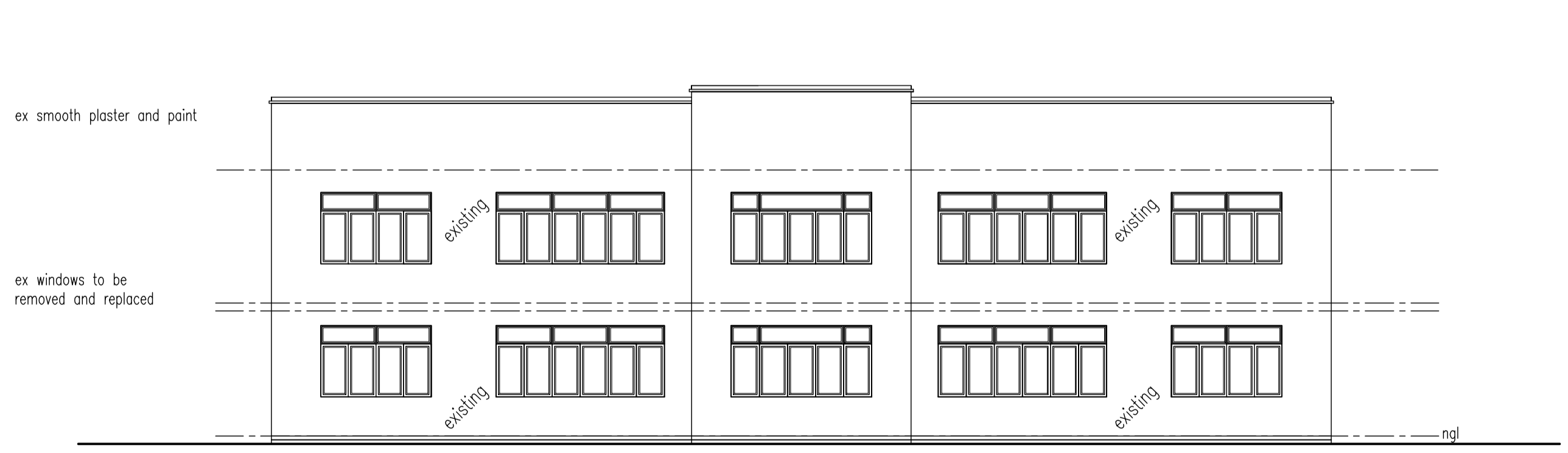
north west elevation