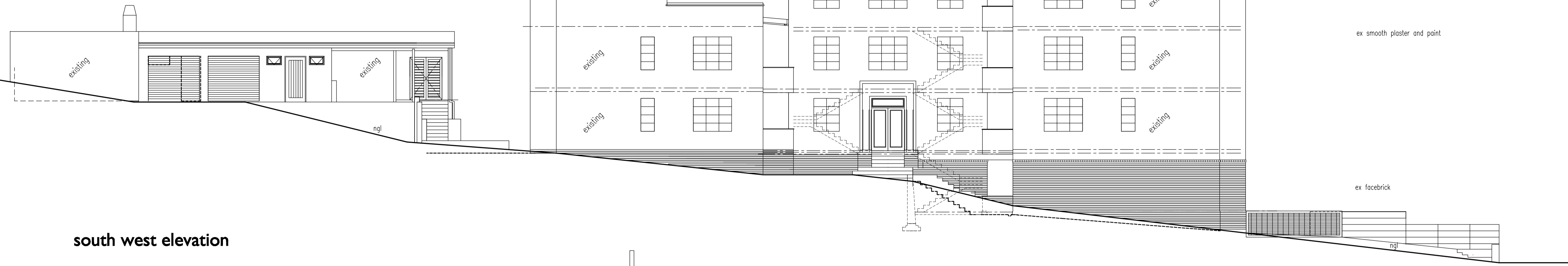
south west elevation