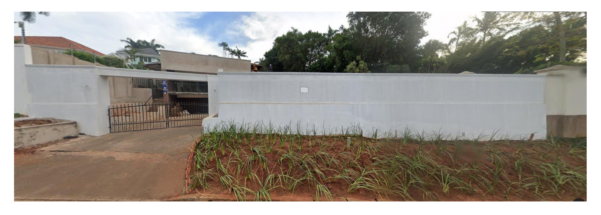
NEW BOUNDARY WALL BUILT FOR SECURITY AND PRIVACY PURPOSES