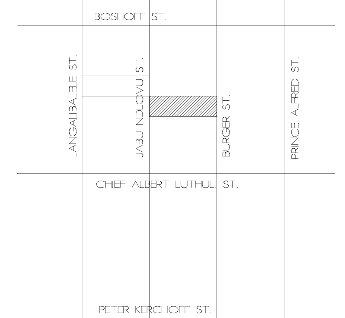
LOCALITY PLAN OF CENTRAL PIETERMARITZBURG