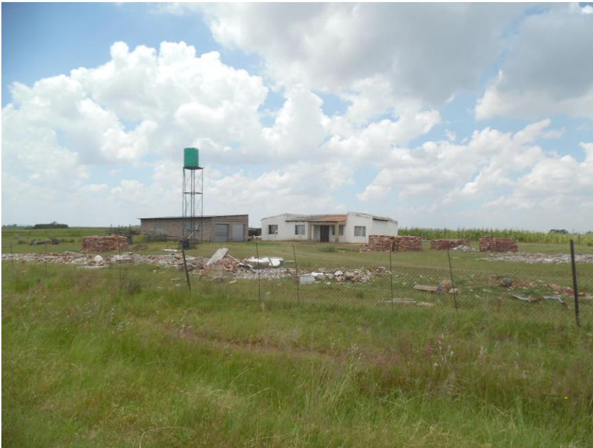
Figure 10: Structures situated in study area