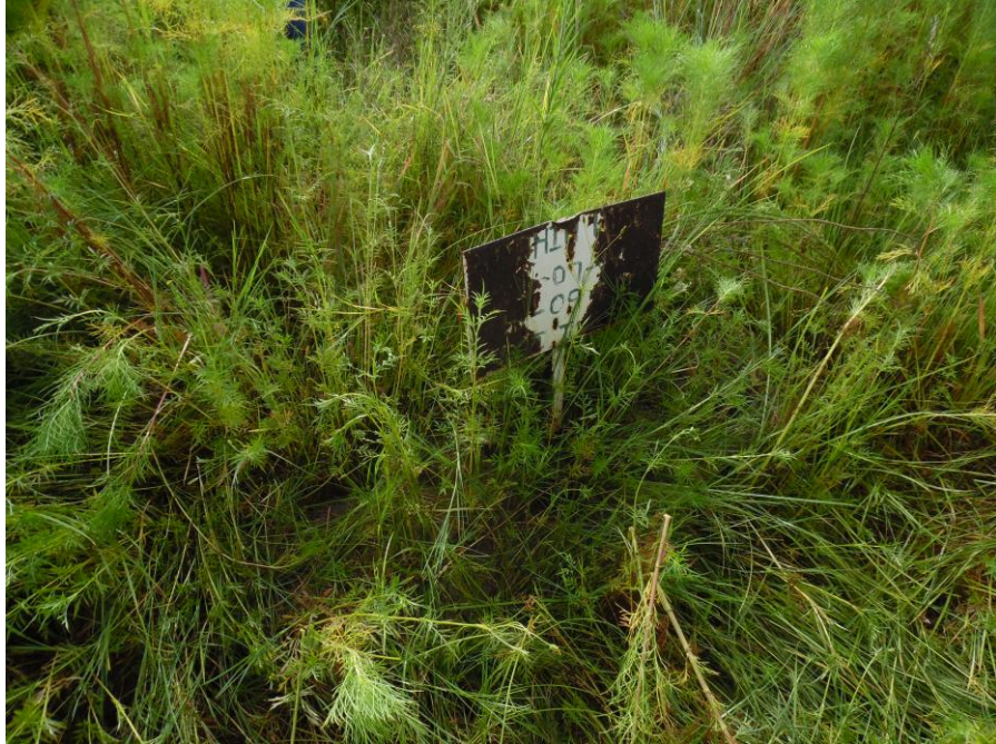
Figure 13: Marked grave