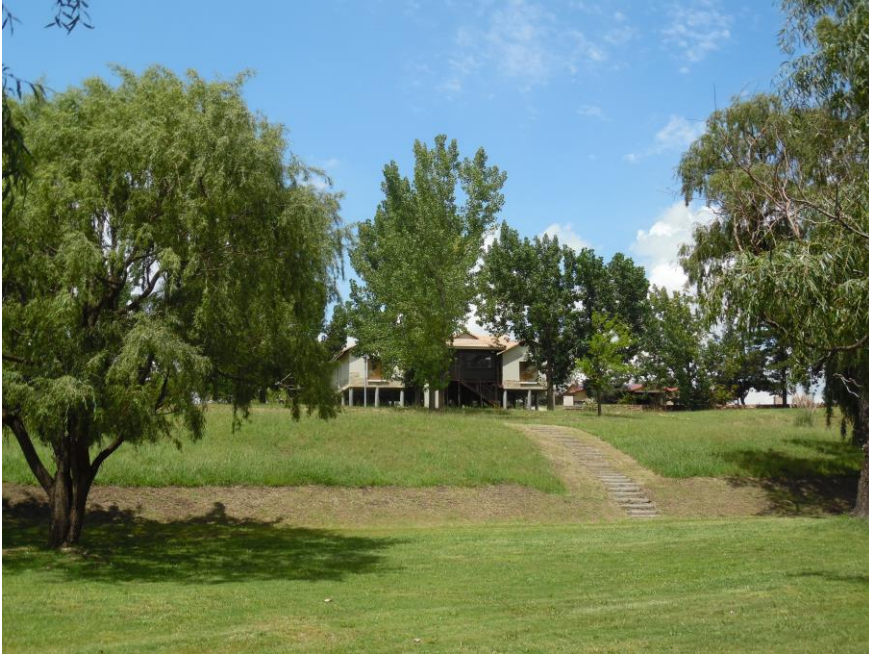
Figure 7: Structure situated in study area