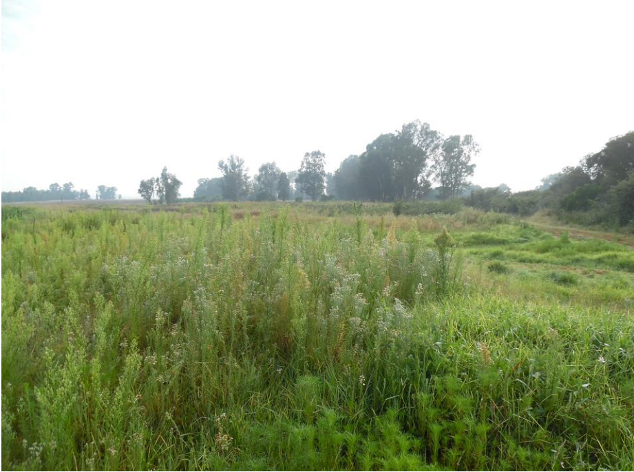
Figure 6: Proposed area for infrastructure