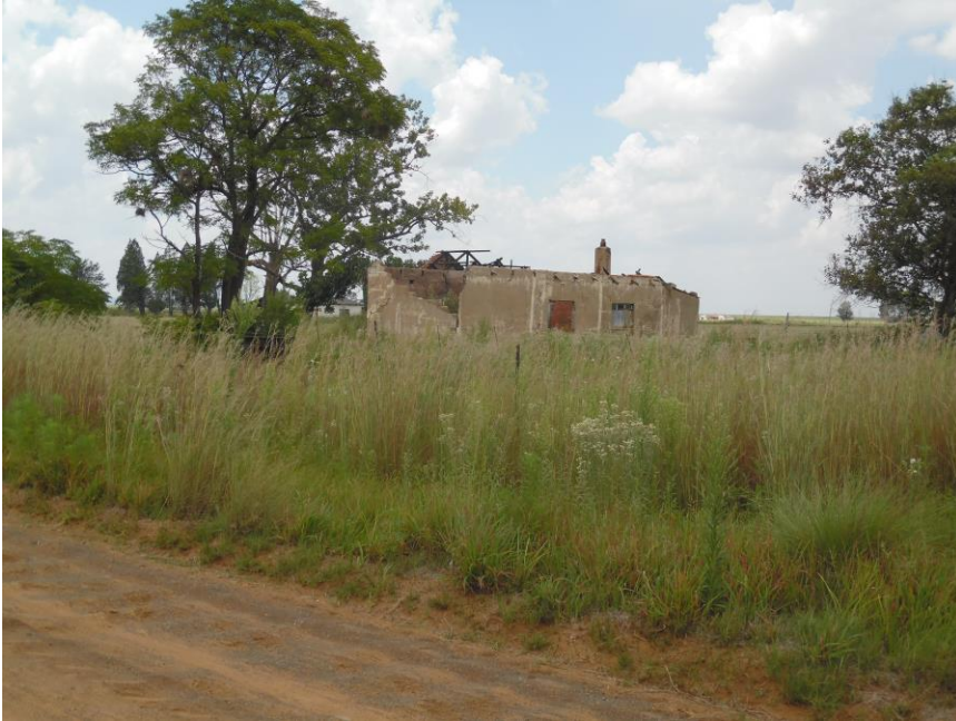
Figure 11: Structure older than 60 years situated in study area