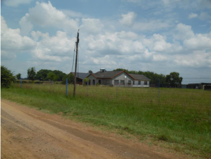
Figure 9: Structures situated area