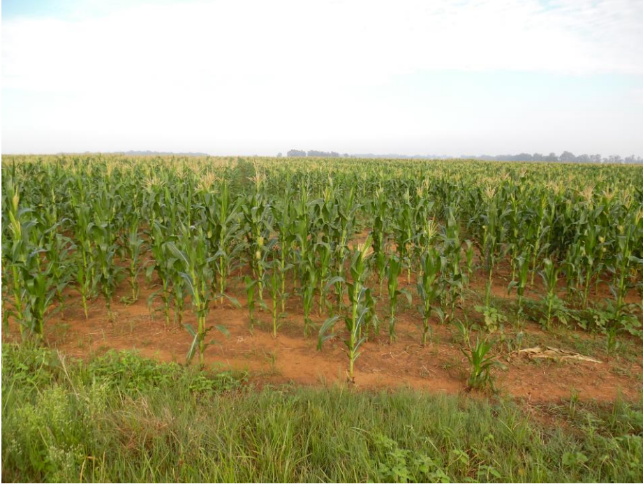
Figure 5: Proposed area for infrastructure