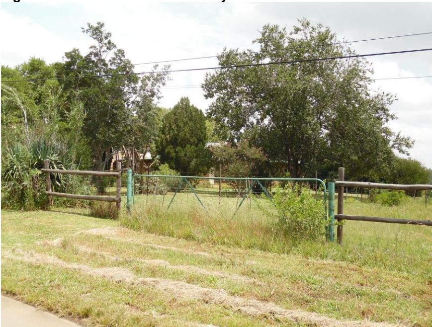
Figure 8: Structure older than 60 years situated in study area