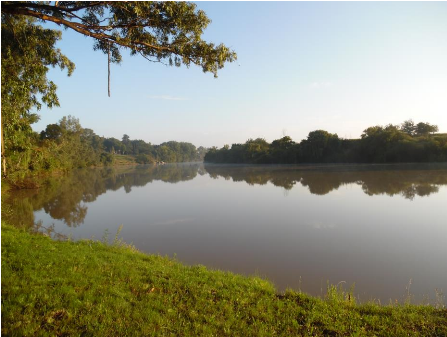
Figure 4: Area near Vaal River