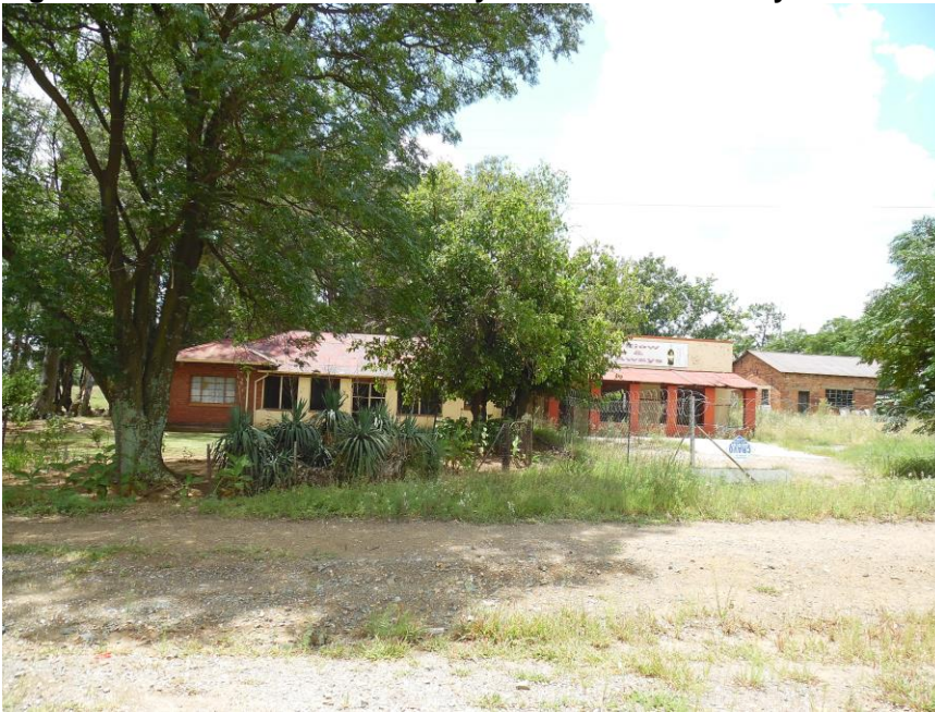
Figure 12: Structures older than 60 years situated in study area