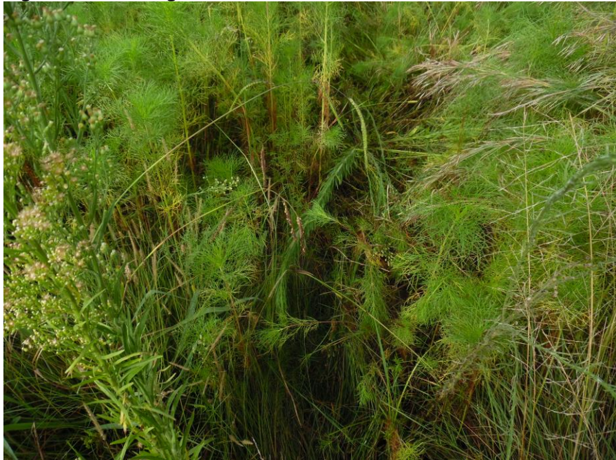
Figure 14: Grave

The possibility of graves not visible to the human eye always exists and this should be taken into consideration in the Environmental Management Plan.