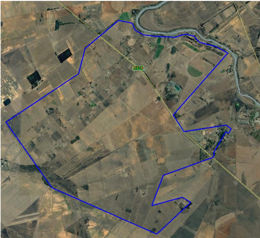
Figure 1: Location map.

The proposed mining right area is set out above in Figure 1. The blue area represents the area to be included into the mining right. The mine planned will be an underground mine.