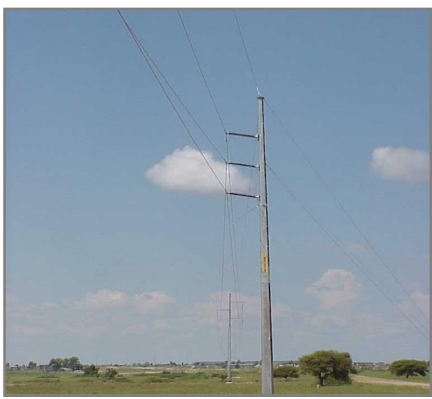
Figure 1. Proposed Tower Type