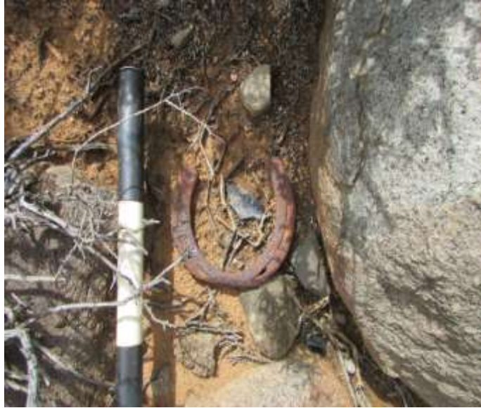
Fig.33: Horseshoe found at Site 24.