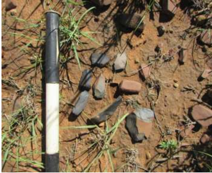
Fig.26: A scatter of Stone tools at Site 22.