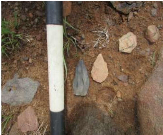
Fig.34: Stone tools at Site 27.