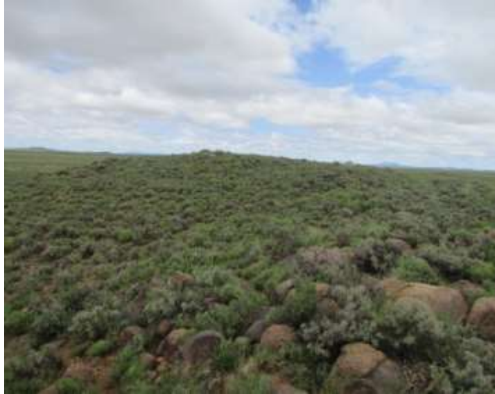
Fig.9: Another of the rocky ridges in the area.