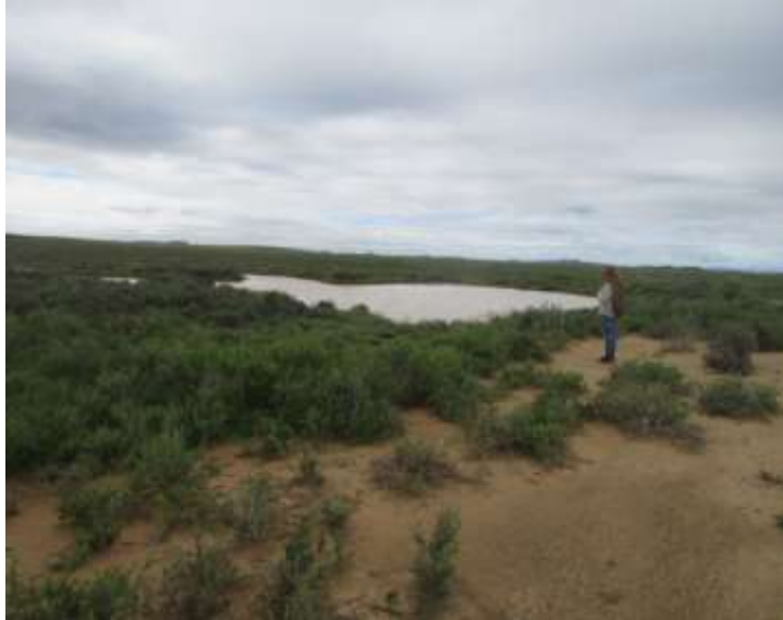
Fig.7: Recent rains have filled pans and streams in the area accentuating the wetlands present here.