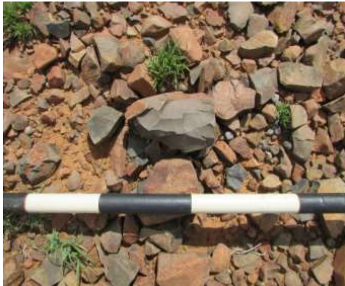
Fig.29: Site 23 contains dense scatters of Stone tools that include cores and flakes.