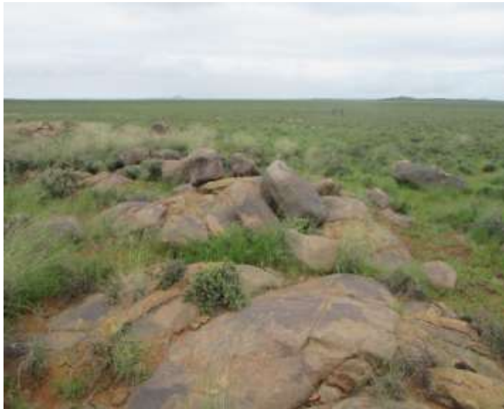
Fig.15: Site 6 location.