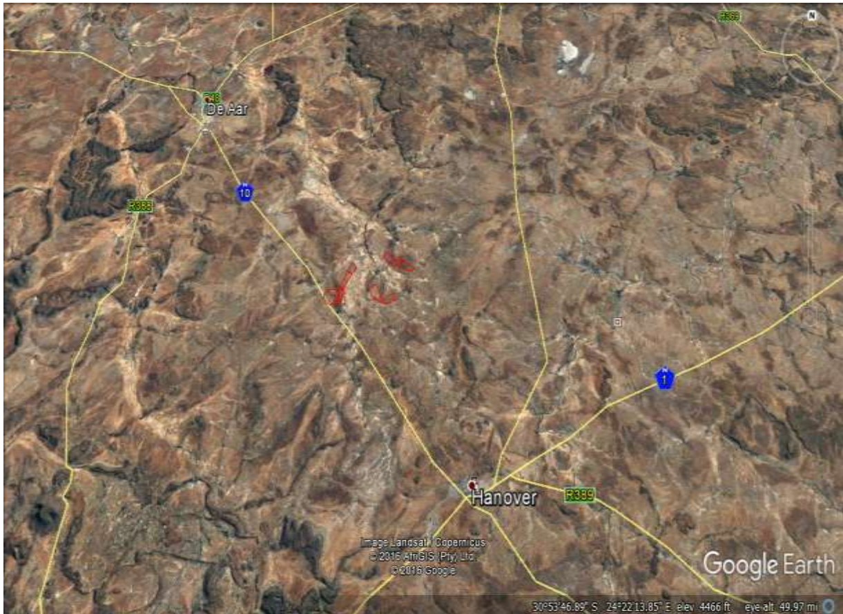
Fig.1: General location of study area. The areas in red are the 3 proposed PV Plant locations (Google Earth 2016).

open, with some rocky ridges/outcrops and low hills surrounding and on the outer boundaries. Visibility was fairly good during the assessment. Recent rains also accentuated the presence of wetlands and streams in the study area, with some sections inaccessible at the time of the assessment. In general the area has not been disturbed by modern developments, except for the railway line that is situated on the northeast of the study area and west of and bordering Area 2 and east of Areas 1 & 3. Existing 400Kv Eskom Powerline corridors cuts through the areas and have had some impact, with the largest other type of impact being agricultural activities (sheep/cattle; grazing and limited crop growing and ploughing). Farmsteads and related infrastructure are also present, but these will not be directly impacted by the proposed development actions.