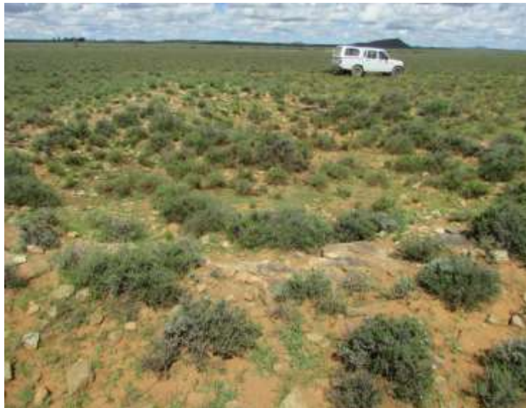
Fig.38: One of three circular “excavations” on Site 36. These are most likely dried-up dams/water holes.