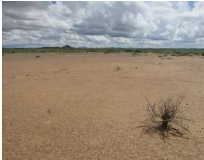
Fig.10: Open areas and wetland sections/dry pans are located throughout the larger area.