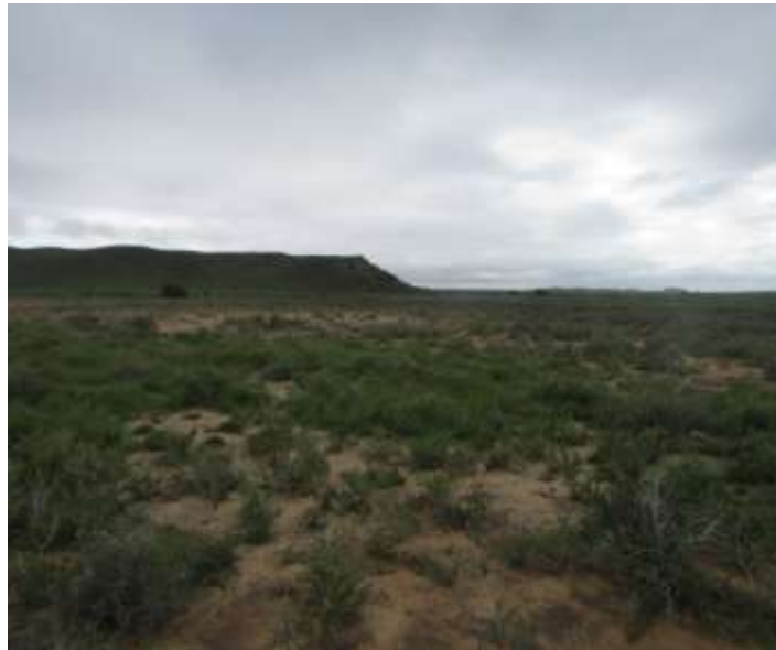
Fig.6: Some rocky ridges and low hills are also located in sections of the study area.