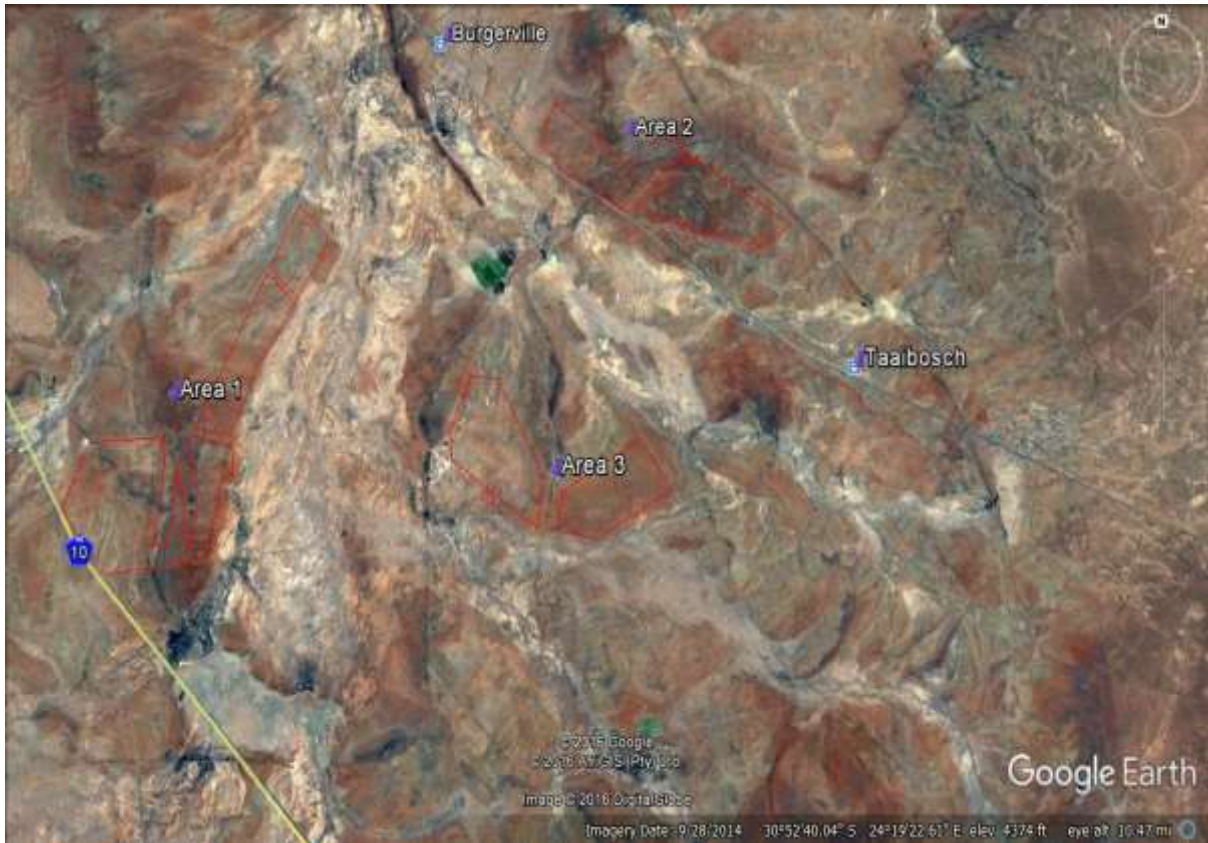
Fig.2: Closer view of study area showing the 3 PV Plant areas (Google Earth 2016).