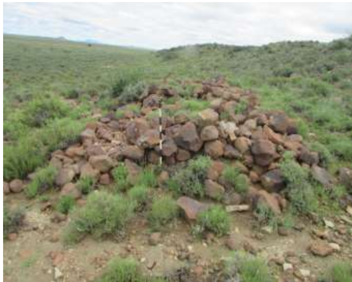
Fig.21: A rectangular enclosure at Site 14.