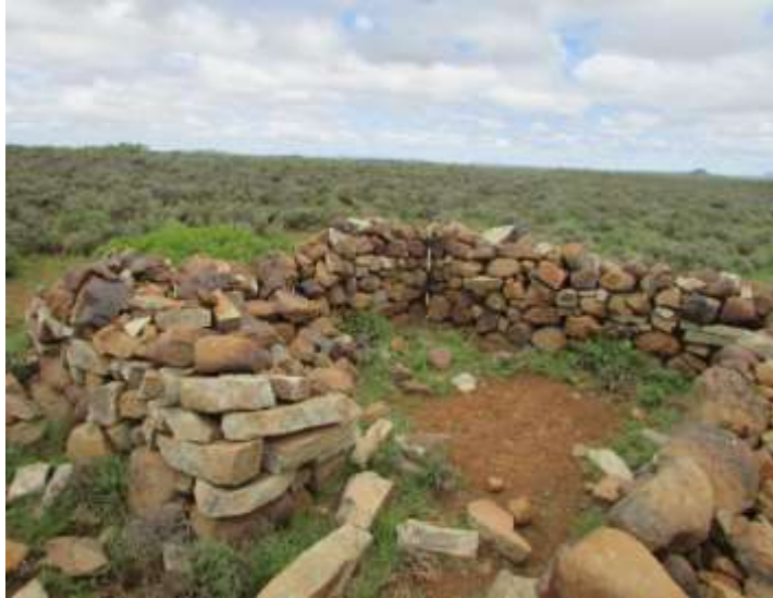
Fig.18: Site 13 stone kraal.