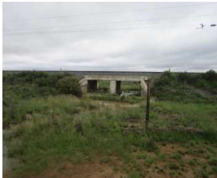
Fig.8: A view of the De Aar-Hanover railwayline.