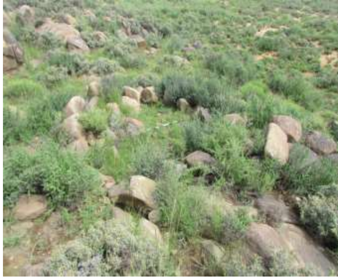
Fig.16: Circular enclosure at Site 10. This is likely an Anglo-Boer War Redoubt.