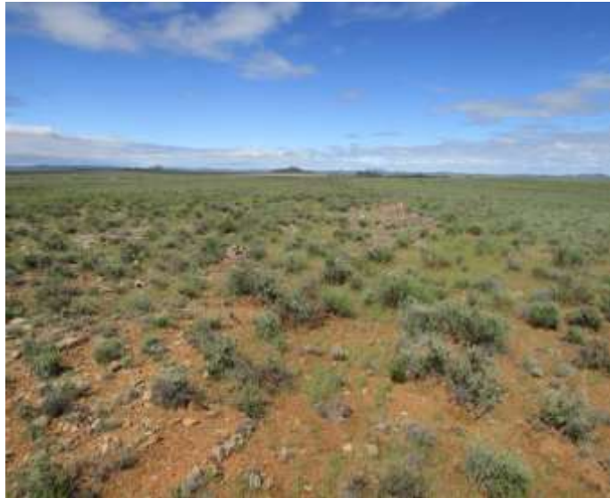
Fig.27: A view of a section of Site 23.