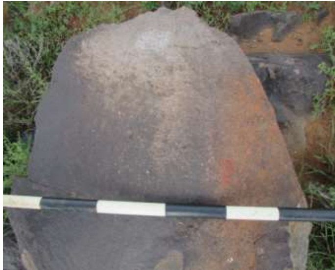
Fig.25: A number of stones close to these Stone-packed enclosures have evidence of being hammered and used.