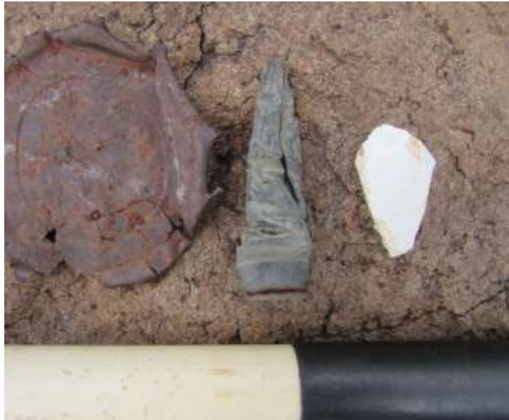
Fig.20: Food tin, spent Martini-Henry cartridge & porcelain from Site 14.