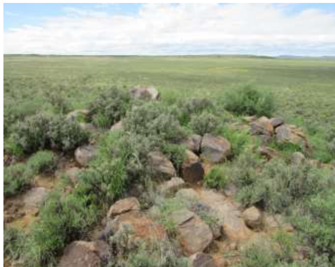
Fig.32: Site 24 Stone-packed feature.