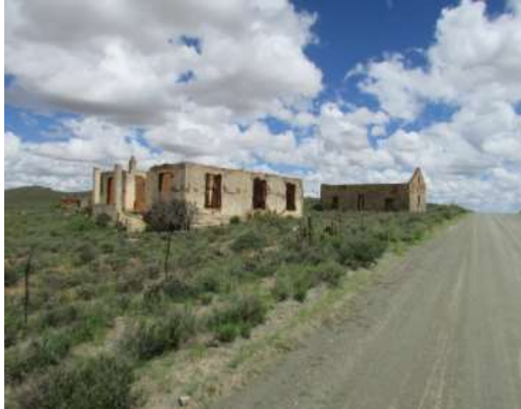
Fig.37: Ruins of old farmstead near Burgerville Site 35.