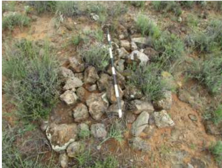
Fig.35: Possible grave at Site 31.