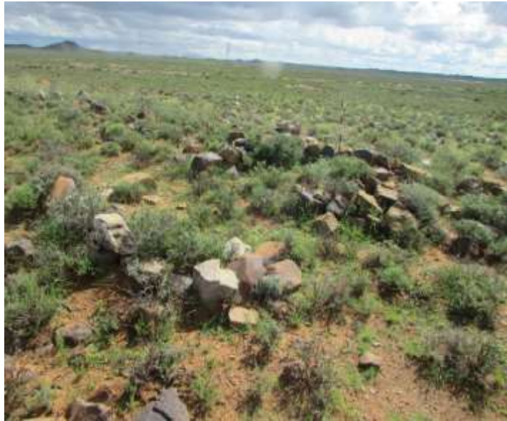
Fig.22: Site 19 stone enclosure/redoubt.