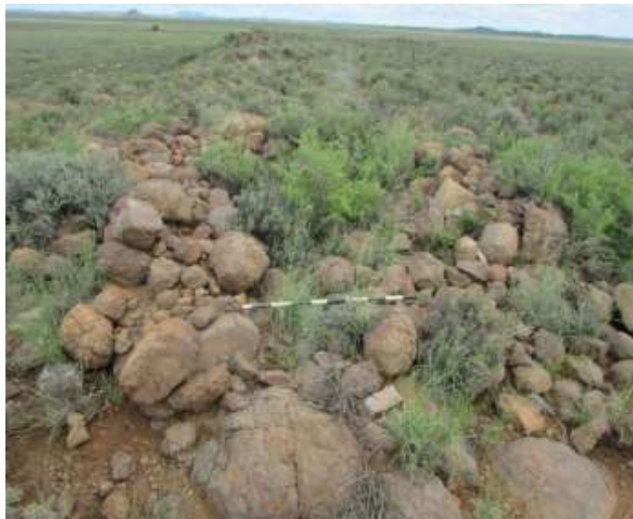
Fig.19: Site 14 stone enclosure. Possible Anglo-Boer War redoubt.