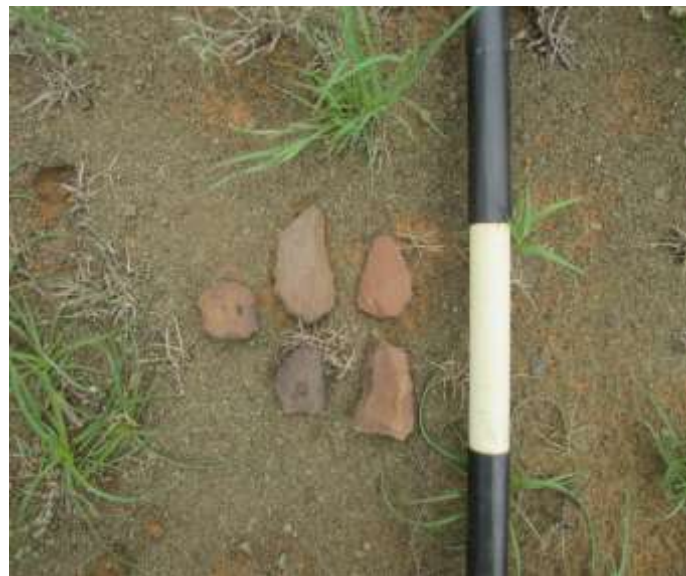
Fig.13: Stone tools found at Site 3.