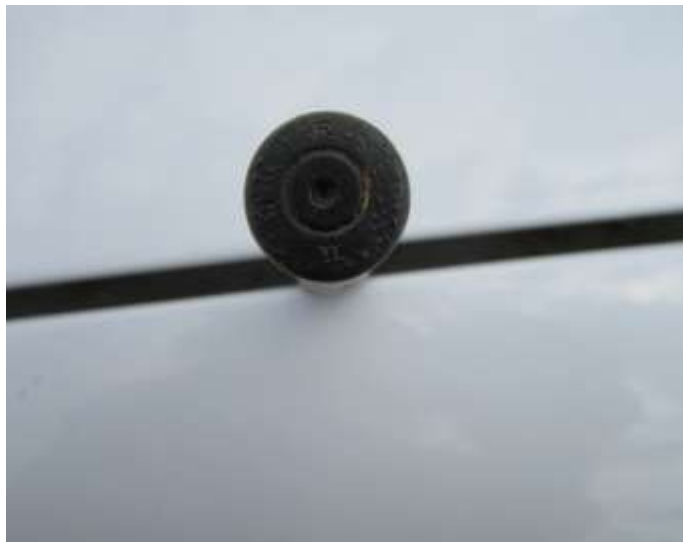
Fig.36: Spent British .303 cartridge at Site 34 dating to the Anglo-Boer War period.