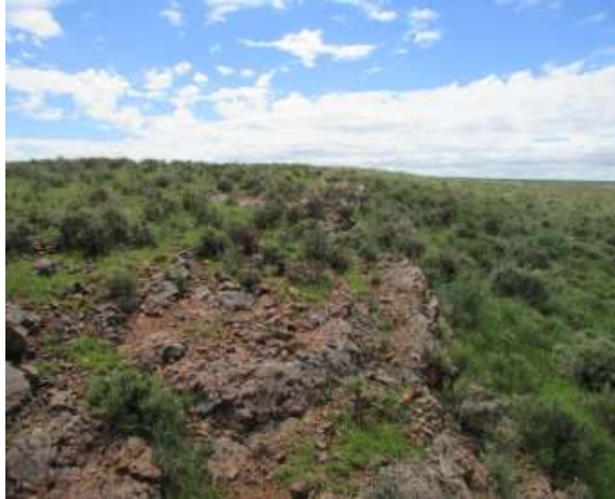
Fig.28: Another section of Site 23.