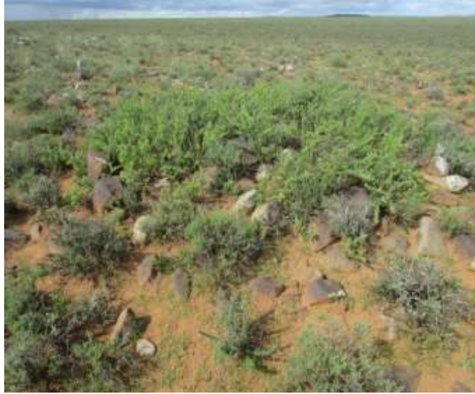
Fig.24: Another stone-packed enclosure at Site 20.