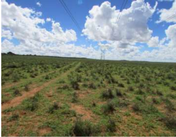
Fig.11: View of one of the ESKOM powerline corridors close to the Area 1 proposed substation.