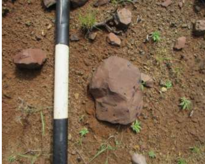
Fig.30: More tools from Site 23.