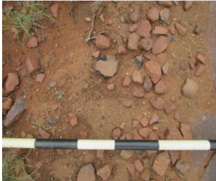
Fig.14: A denser scatter of Stone tools at Site 6.