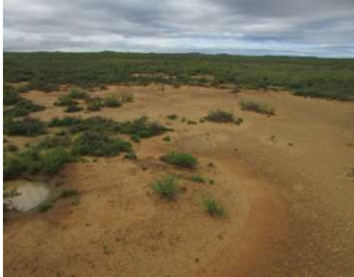
Fig.5: A view of a section of the larger area showing some open eroded areas.