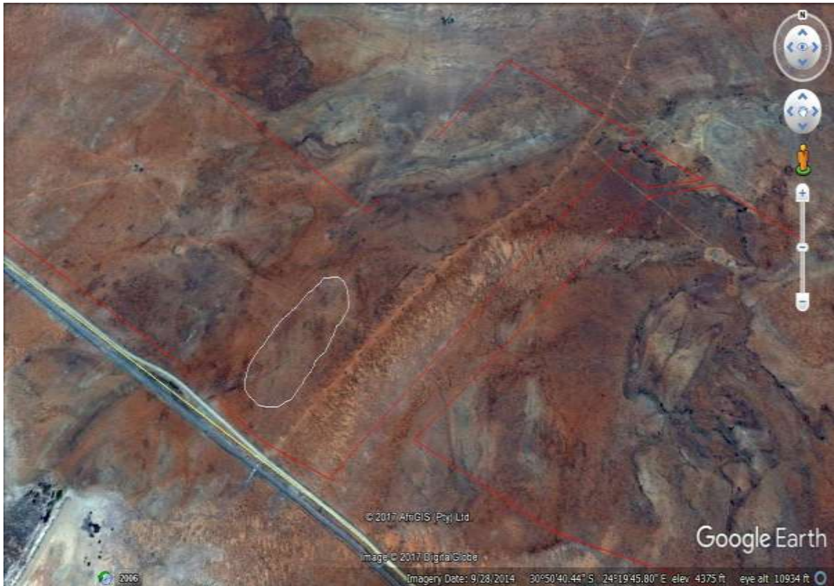
Fig.39: Aerial view showing possible extent of Site 23 Stone Age scatter & material (Google Earth 2017 – Image date 28/09/2014).