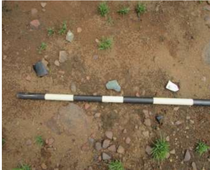
Fig.17: Late 19 th century glass and porcelain at Site 10.