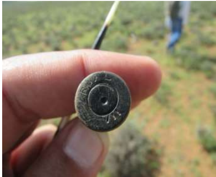
Fig.23: A late 19 th century British .303 cartridge at Site 19.