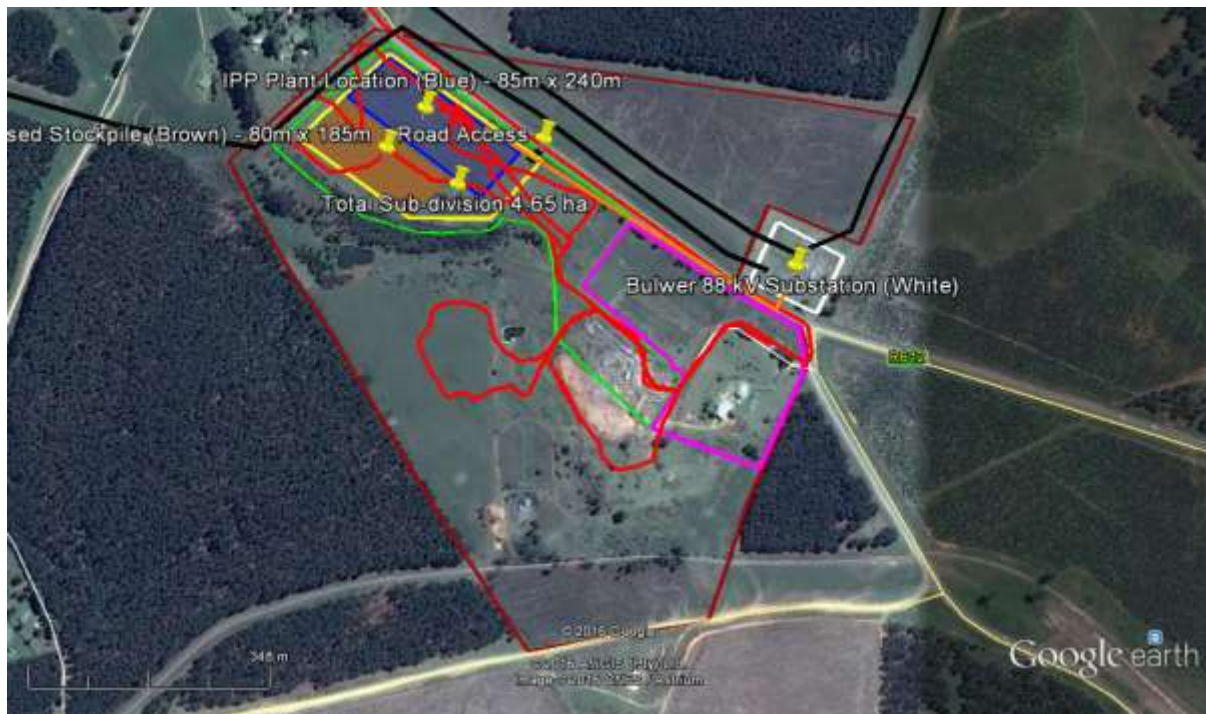
Figure 4: GPS track of the surveyed area. North reference is to the top. The area of impact is the yellow area which was surveyed with more intensity as the remainder.

Certain factors, such as accessibility, density of vegetation, etc. may however influence the coverage. The survey was done during October 2015 when the vegetation cover was reasonably low due to the lateness of summer rainfall. The size of the entire development area is 26 Ha, but impact is only foreseen on a 2 Ha section. The study took 2 hours to complete.