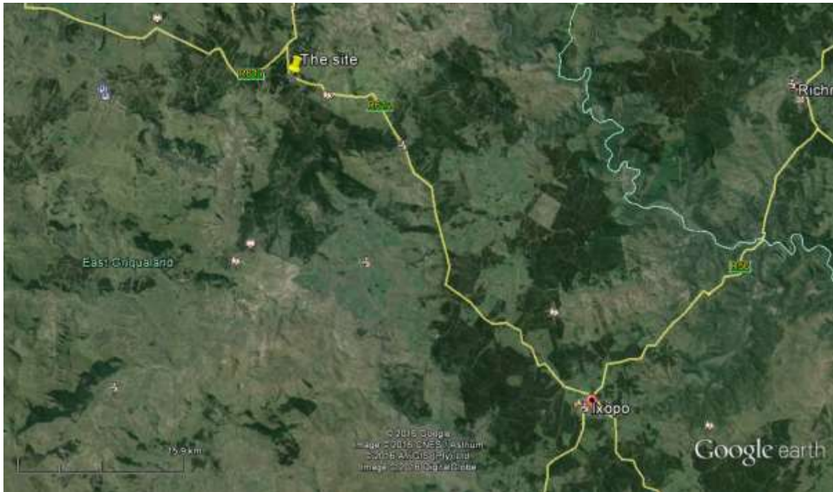
Figure 2: Location of the site in relation to the town of Ixopo in the KwaZulu-Natal Province. North reference is to the top.