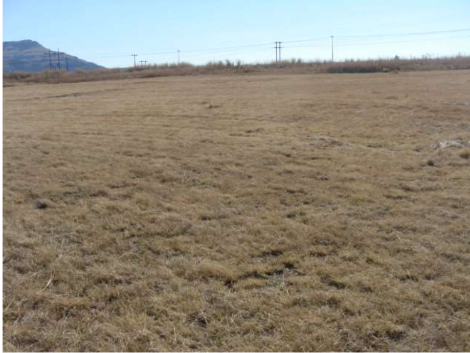
Figure 10: Old agricultural field in the surveyed area.