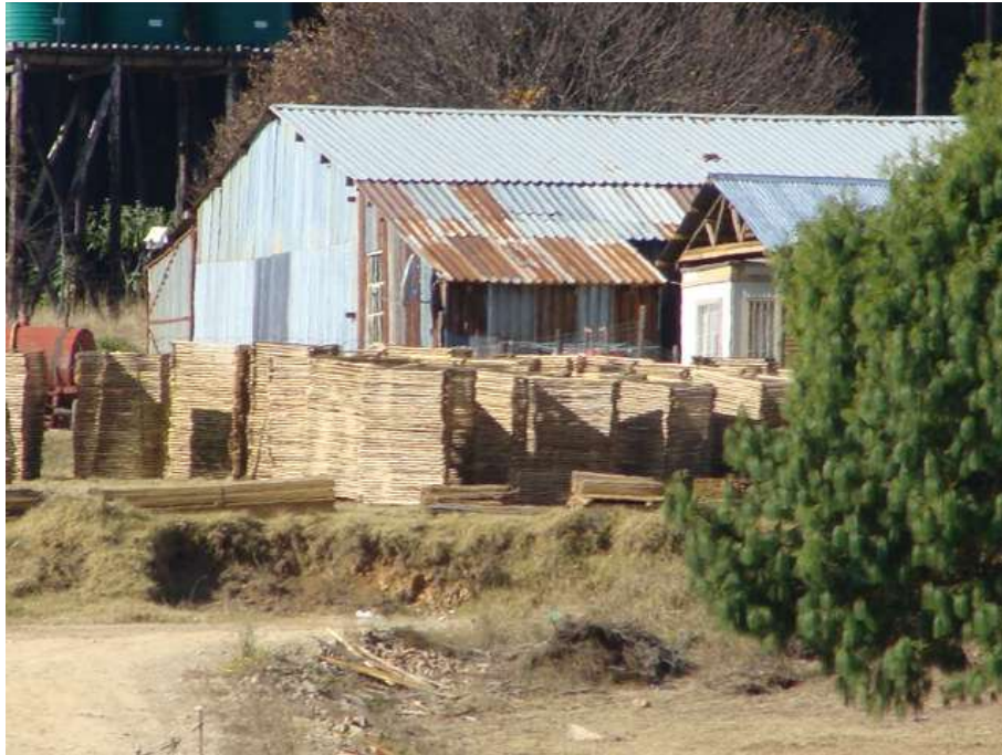
Figure 12: Corrugated iron building in the surveyed area.