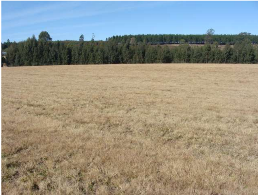
Figure 8: General view of vegetation in the area of impact.