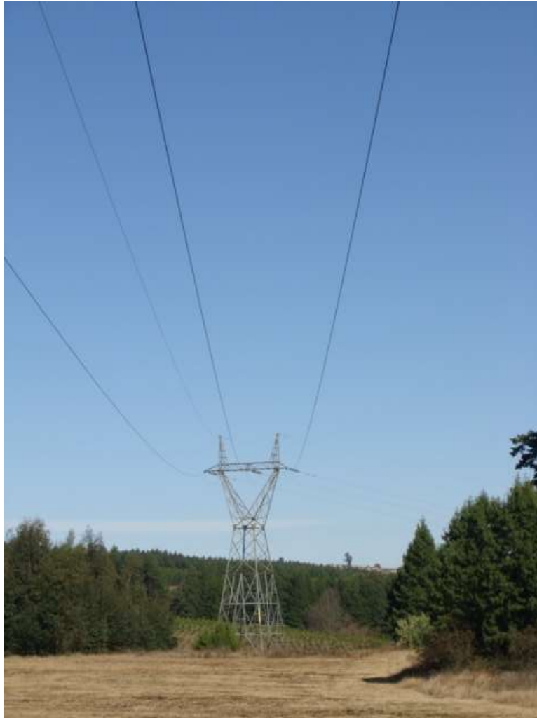
Figure 7: View of power lines in the surveyed area.