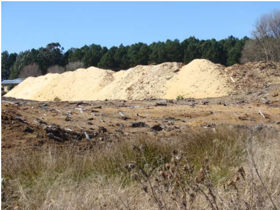
Figure 6: General view of the area adjacent to the sawmill.