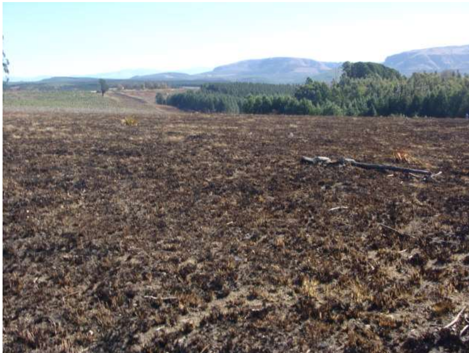
Figure 9: Burnt field just outside of the area of impact.