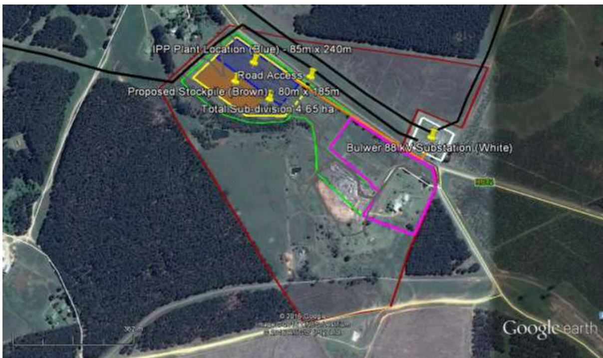
Figure 3: Google Earth image indicating the proposed development. The pink area is an existing saw mill which will continue operations. The yellow area is the area where impact will be experienced.