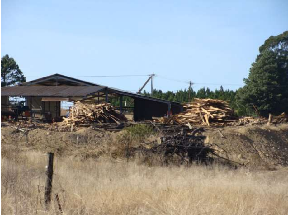
Figure 5: View of the area where the sawmill is situated.