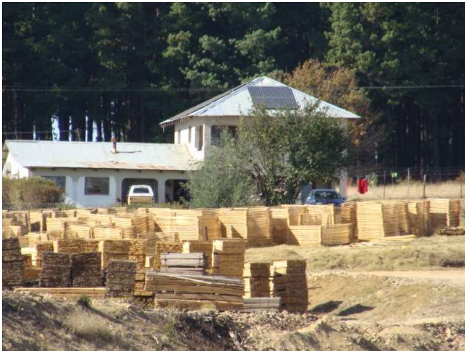
Figure 11: One of the buildings at the site.