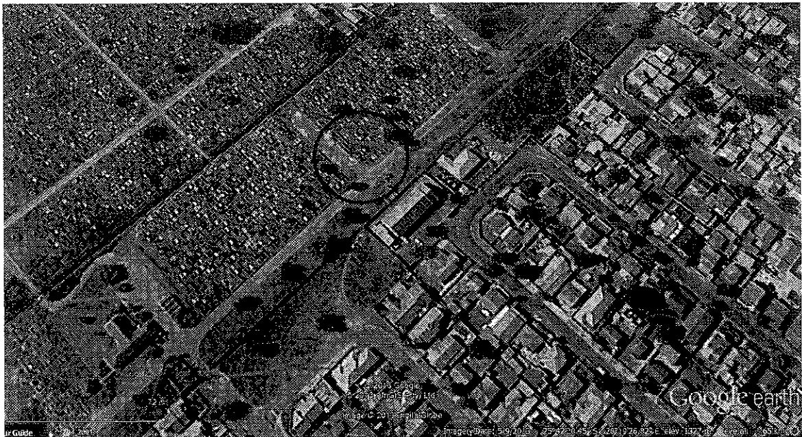
Rev. Sefako Mapogo Makgatho Mamelodi-West Cemetery.