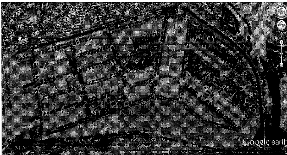
Dr. Christiaan Beyers Naude's grave in Westpark Cemetery, Montgomery Park Johannesburg.

Printed by and obtainable from the Government Printer, Bosman Street, Private Bag X85, Pretoria, 0001 Publications: Tel: (012) 334-4508, 334-4509, 334-4510 Advertisements: Tel: (012) 334-4673, 334-4674, 334-4504 Subscriptions: Tel: (012) 334-4735, 334-4736, 334-4737 Cape Town Branch: Tel: (021) 465-7531