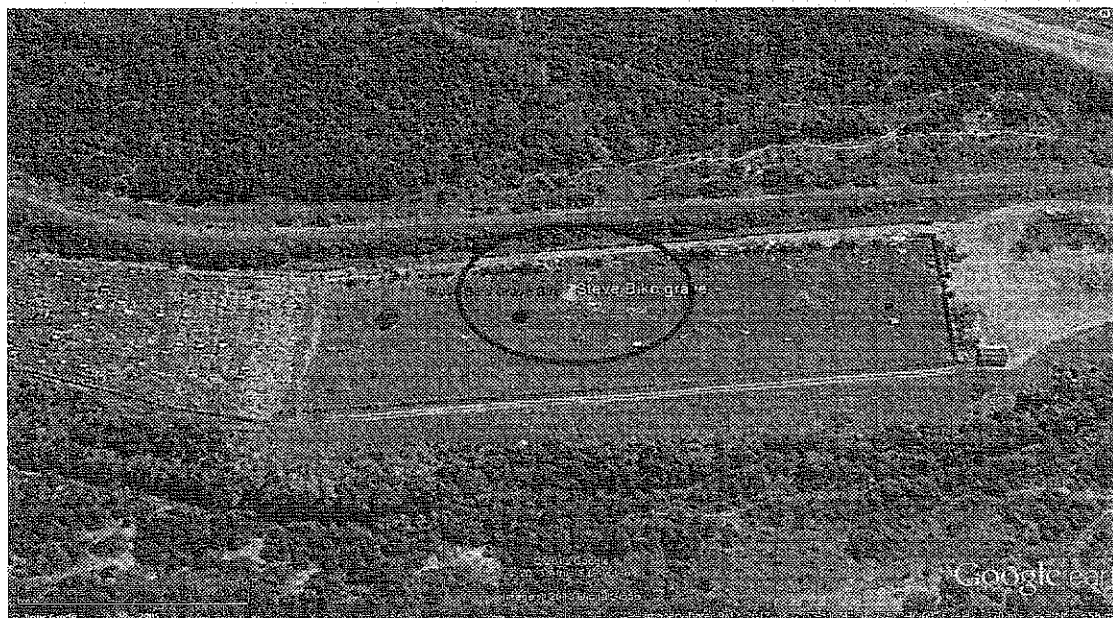
The grave of Stephen Bantu Biko in the Ginsburg Cemetery, King William's Town.