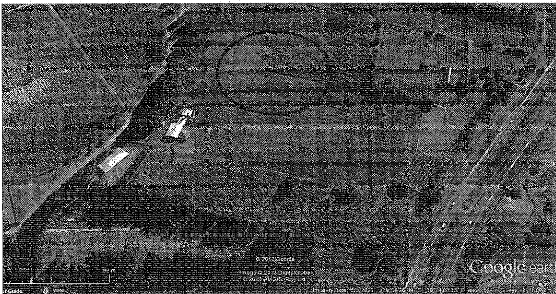
Josiah Tshangana Gumede's grave in Block T Mountain Rise Cemetery, Pietermaritzburg