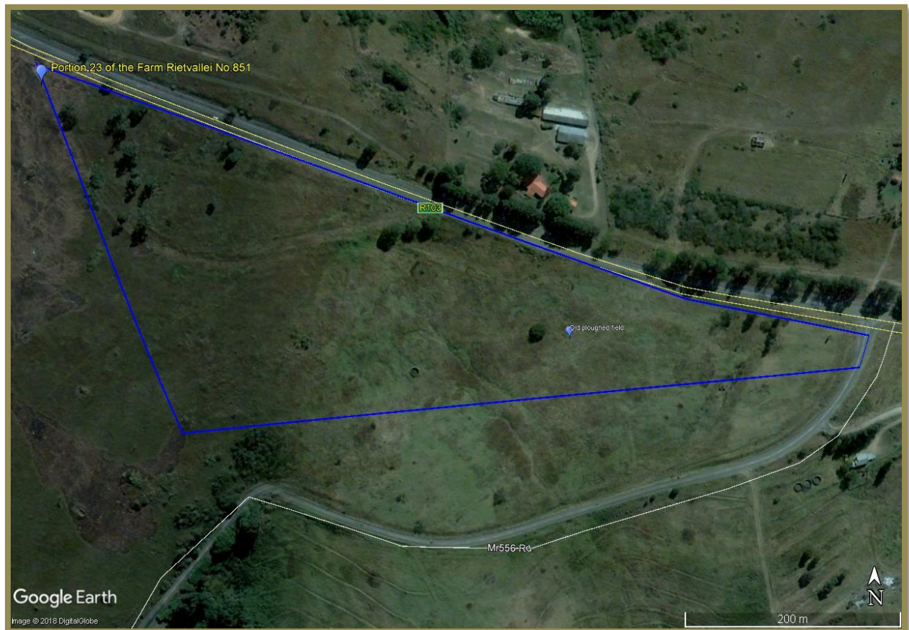
Figure 3 Portion 23 of the Farm Rietvallei No.851 showing plough disturbance vehicle-tracks. (See kml. loaded to SAHRIS).

The now fallow land is largely covered in Aristida junciformis grass, an unpalatable and indicator species of overgrazing, and thick stands of trifid weed ( Chromolaena odorata ), Lantana camara and umbongabonga / bugweed ( Solatum mauritianum ) have colonised the understory of the larger Ficus and Acacia trees present on the property. Much of the vacant land in the immediate surrounds, prior to infrastructure development, has been utilised as “communal” grazing by cattle-keeping residents in the adjacent Ximba Traditional Authority and Fredville Informal Settlement in the Valley of a Thousand Hills.