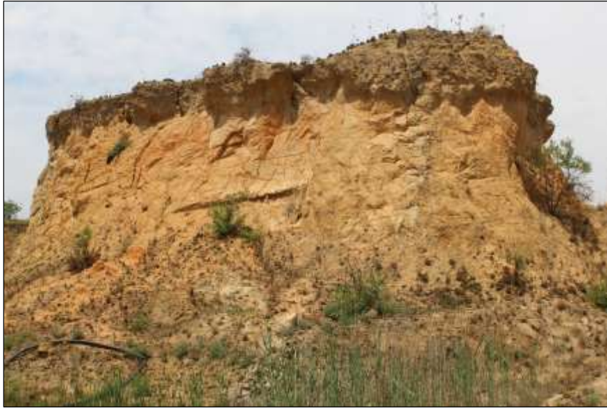
Figure 4: Another close snapshot from the east shows developing overhang and undercutting erosion. Some fault lines can be seen developing at the top the pedestal, signs of physical stress and warning of eventual failure and collapse.