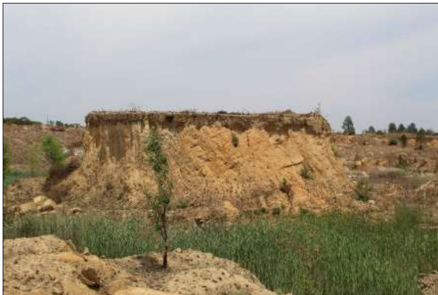
Figure 2: Close view of the earth pedestal.