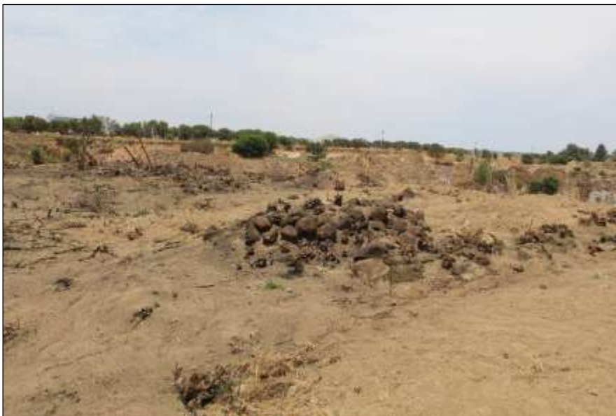
Figure 5: The graves on top of the pedestal are marked by stone cairns.