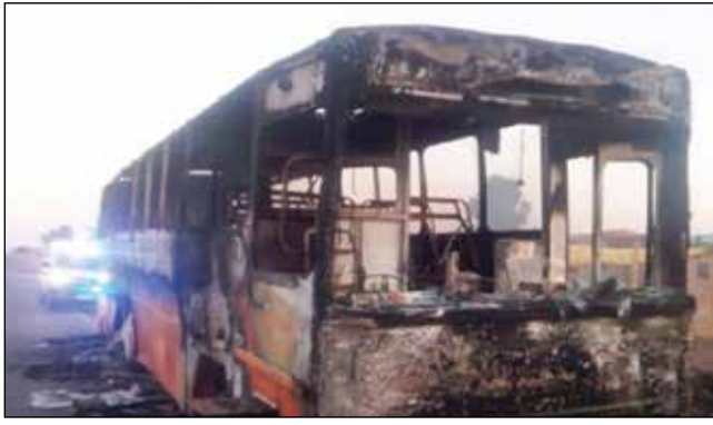
The remains of a truck which was torched on R25 and Loskop Road in Moutse when a group of would-be looters started gathering around Moutse Mall on Monday afternoon.