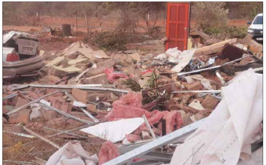
The remains from the family's house.

“Our thoughts are with the bereaved family. We pray that the injured man also recovers.”