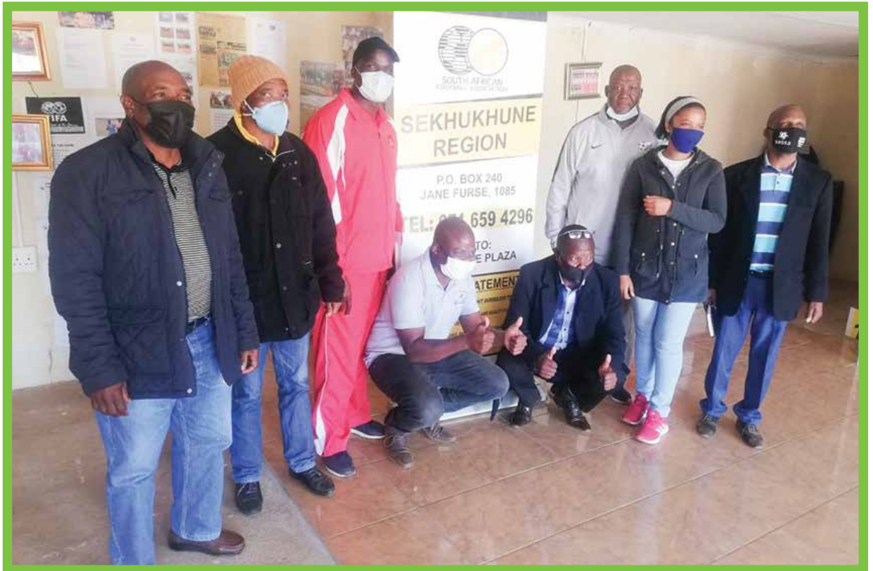
Members of the South African Football Association in Sekhukhune and members of the Sekhukhune Sports Confederation posing for picture after a meeting held in Jane Furse on Tuesday