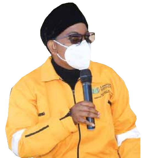
MEC for Transport and Community Safety, Mavhungu Lerule-Ramakhanya.