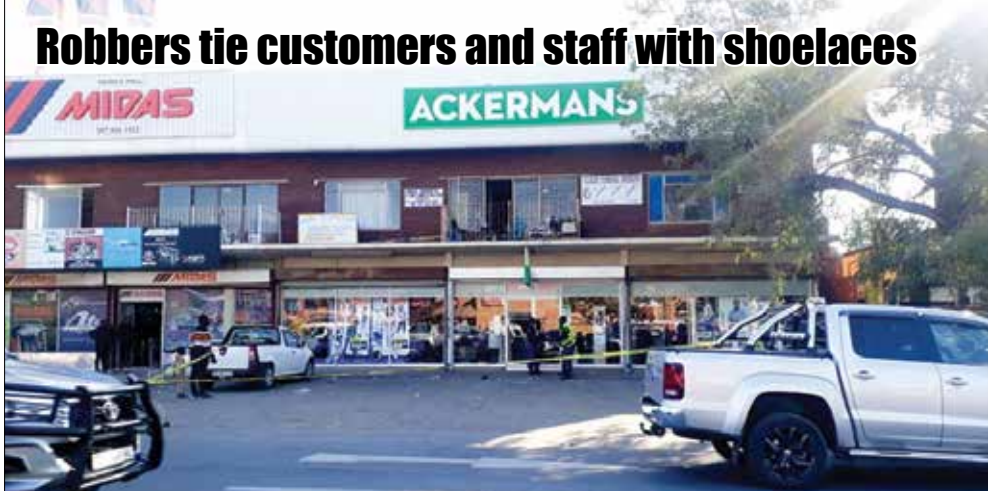
The scene of the crime and some of the items police recovered during a business robbery incident at the Ackermans clothing store in Marble Hall last Friday.

but their own as well as those of their handlers. The people of Moutse in Sekhukhune are law abiding citizens who would under no circumstances burn tyres or loot businesses in the name of an individual. Sekhukhune and indeed the whole country cannot be held at ransom and rendered ungovernable by criminals masquerading as political activists,” concluded Mogotji.