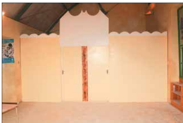
A view of the office after partitioning..