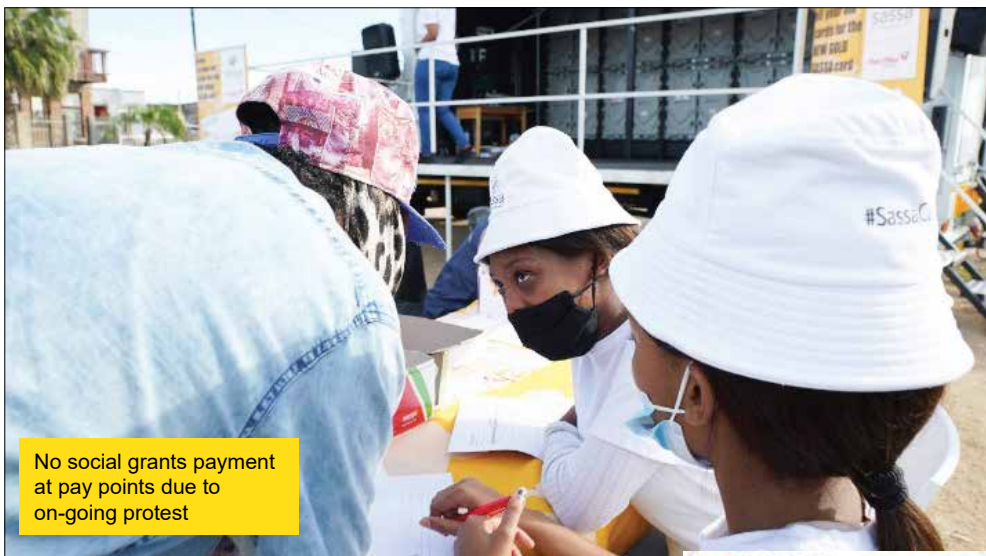
No social grants payment at pay points due to on-going protest

"Beneficiaries are advised to use alternative means to access their