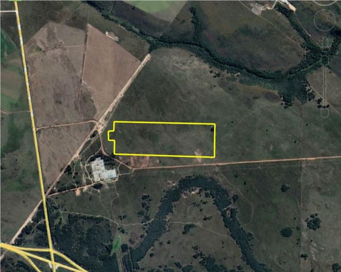
Figure 1: Google Earth photo indicating the study area (yellow polygon)

The study site is situated on a farm north of Humansdorp south of the Swart River and east of the R330 and north of the N2.