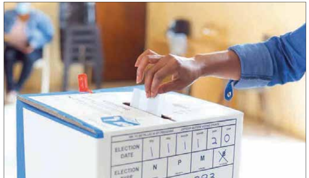
Moseneke's inquiry recommend upcoming election to be postponed.

dations are not binding, the independent commission emphasised the need to prioritise people's lives and health