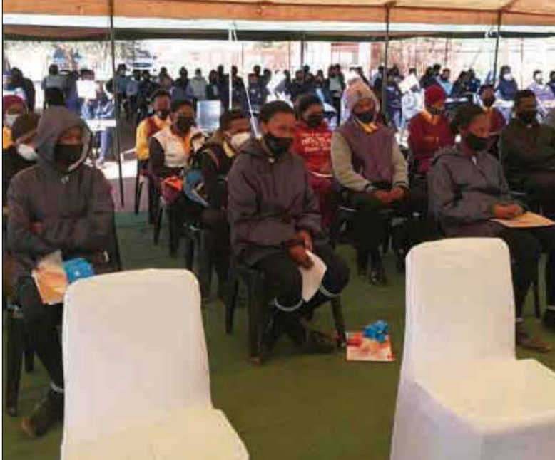
Mampotjane, Mamagogo and Phasoane Secondary Schools within Lepelle-Nkumpi 2 Circuit.

ZEBEDIELA Ga-Seloane Traditional Authority in partnership with Capricorn District Municipality hosted a career information sharing session at Ga-Seloane recently.