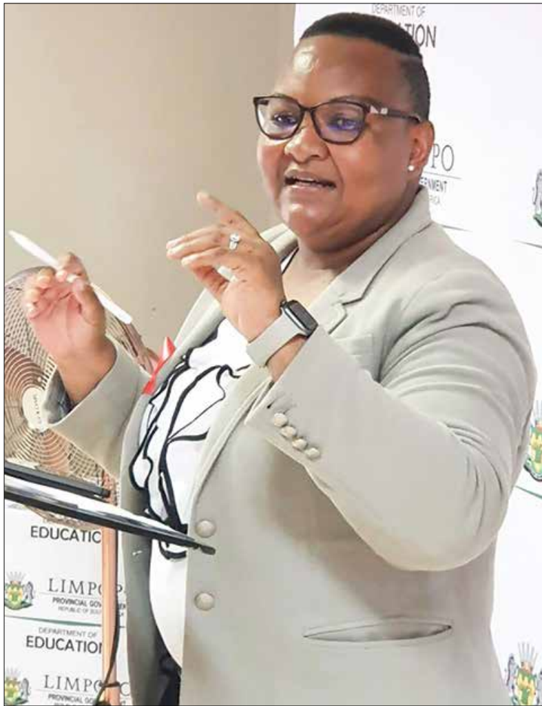
Limpopo MEC for education Polly Boshielo.