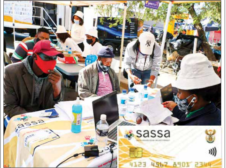
SASSA resumed to make payments at pay point.