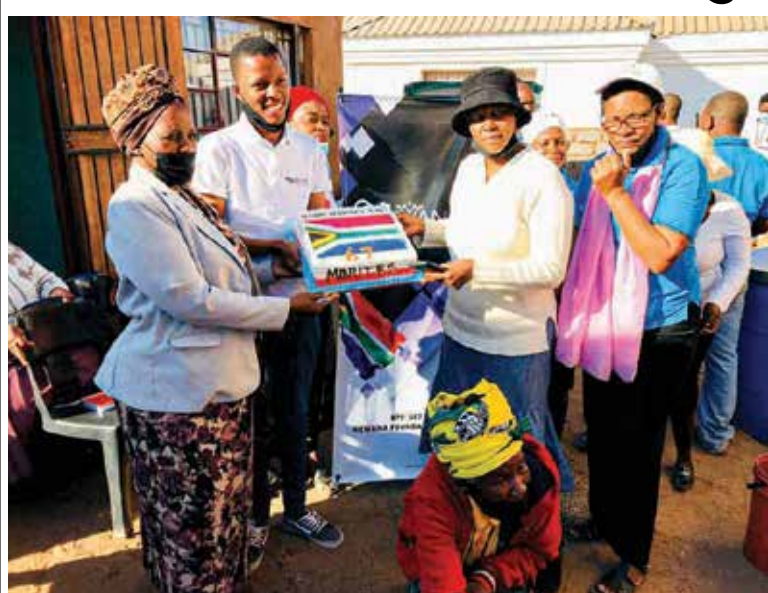
The elderly were handed gifts on Mandela Day.