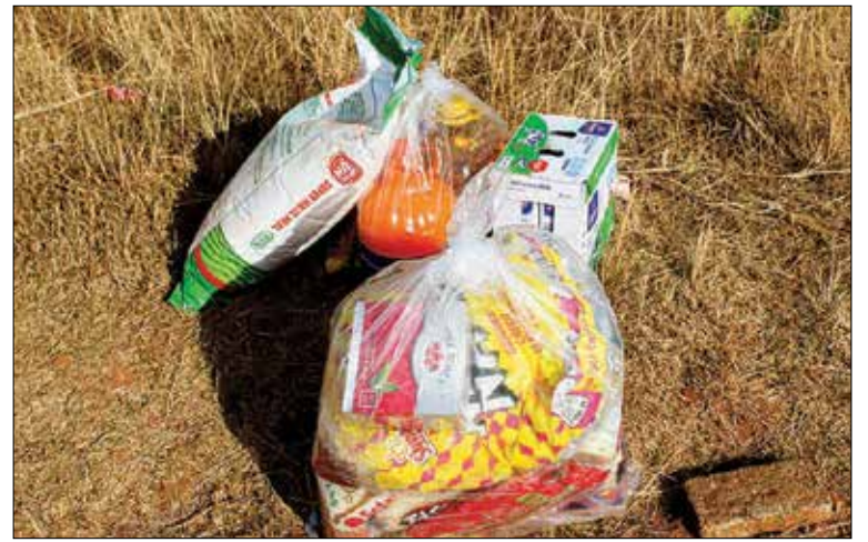
Some of groceries.