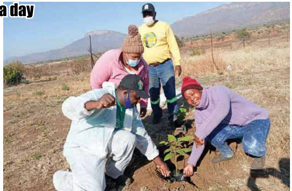
The locals hard at work planting trees.

Nelson Mandela Day is an annual celebration of Mandela's life and a global call to action for people to recognise their ability to do something to change the world around them. On this day, people around the world are asked to devote 67 minutes of their time, changing the world for the better in a small gesture of solidarity with humanity. It celebrates the 67 years of his life that Mandela gave in the struggle for justice.