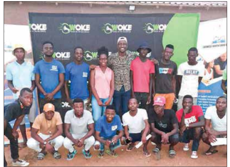
Young people were invited to officially announce the plans to contest elections