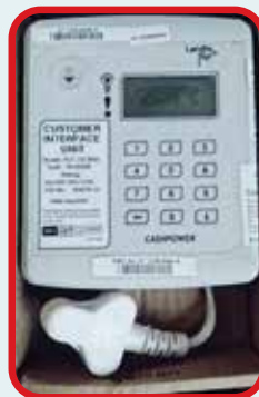
The residents of Roosenekal outside Groblersdal within Elias Motsoaledi Local Municipality call for the local municipality to enable them to buy electricity directly from Eskom.