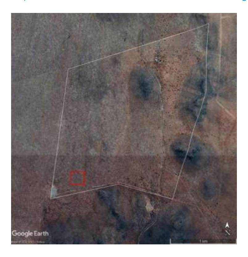
Figure 1: Position of the proposed BESS in red, in the lower south-west corner near the substation.