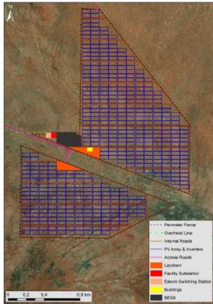
Figure 1: Position of the proposed BESS in grey near the substation.