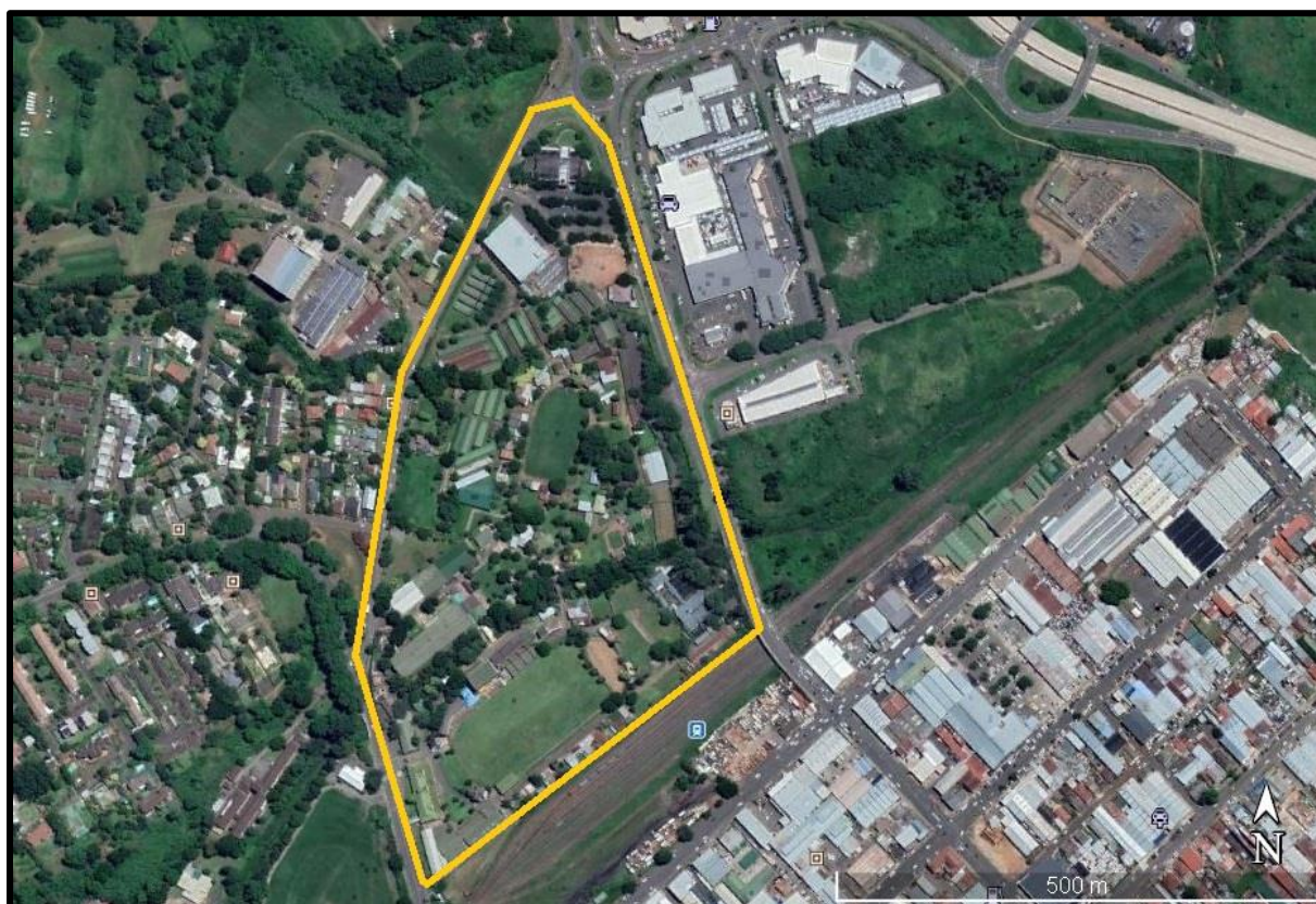
Figure 2: Satellite image showing a close-up view of the proposed location of the site footprint, indicated by the yellow polygon. As can be seen in the image, the location is already a development zone comprising fields, buildings and roads.