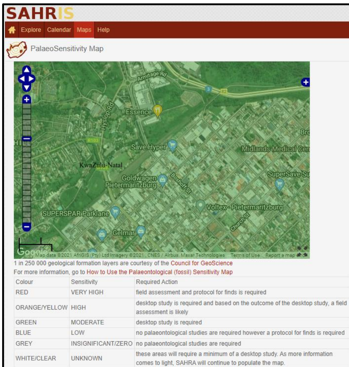
Figure 4: Map of how the geology in Fig.3 translates into palaeo-sensitivity. The geological unit which occurs beneath the site footprint has a ranking of green and corresponds to the Pietermaritzburg Formation of the Ecca Group, a rock type which has a low likelihood of significant fossil occurrences. Modified from the SAHRIS map, www.sahra.org.za/sahris/map/palaeo